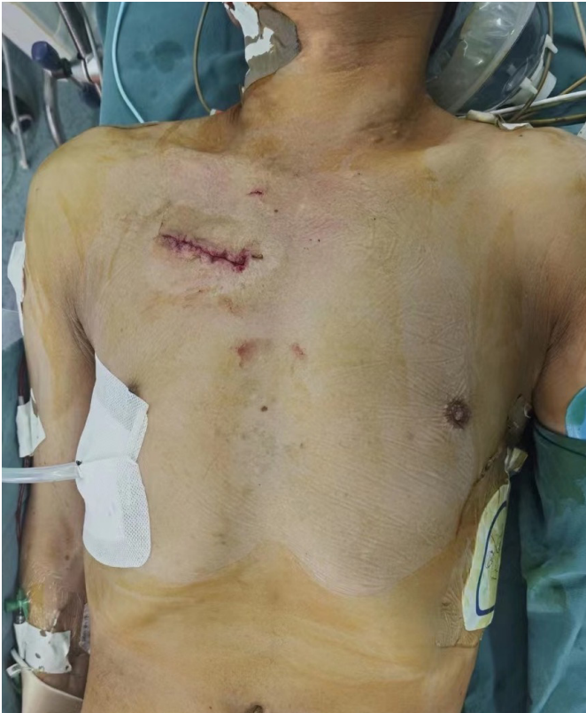
Fig. 2 - Surgical opening length.