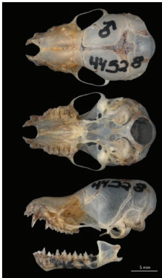
Figure 3. Dorsal, ventral, and lateral views of skull and lateral view of mandible of an adult male of Myotis occultus collected in the Protected Natural Area (PNA) of Cuenca de la Soledad, Municipality of Guanajuato, Gto., Mexico.