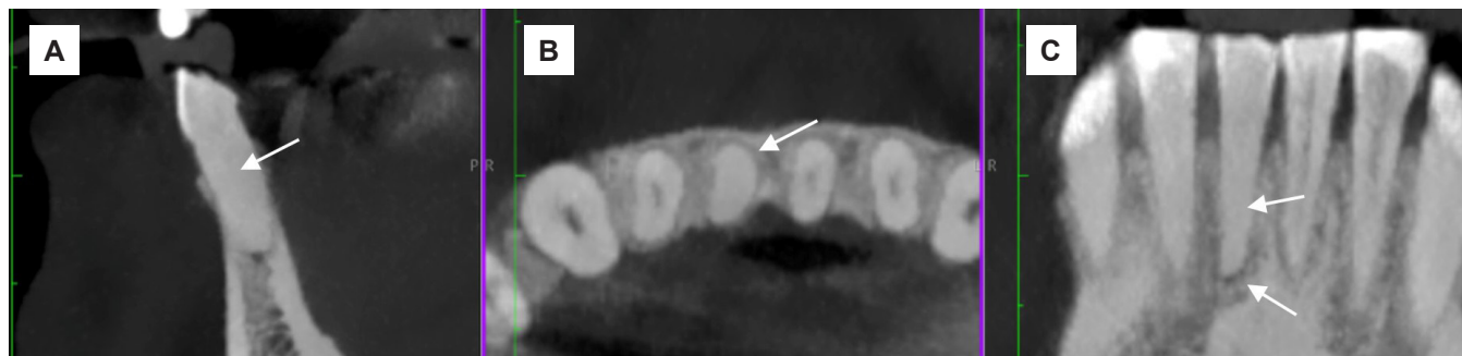
Figure 2. Observation of severe obliteration and periapical pathology in CBCT: A) Observation of severe obliteration in the sagittal section; B) Observation of severe obliteration in the axial section; C) Observation of severe obliteration in the transaxial section and presence of periapical pathology.