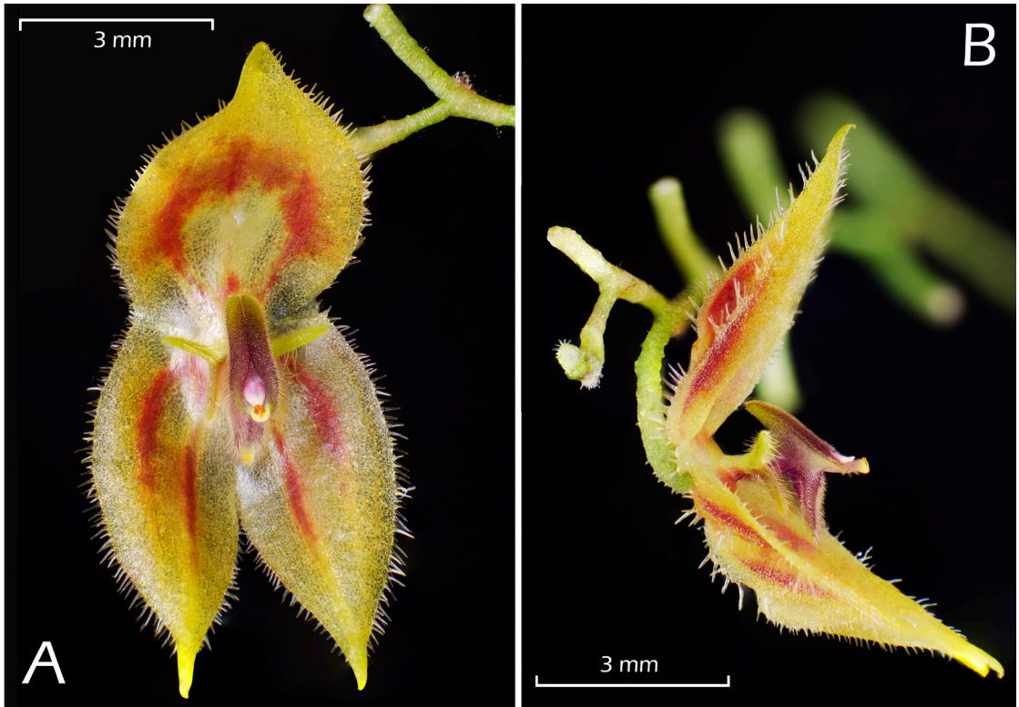
FIGURE 2. Photographs of the flower of Lepanthes mashpica Baquero & T.S.Jaram. A. Frontal view. B. Lateral view.

DIAGNOSIS: Lepanthes mashpica is most similar to L. satyrica Luer & Hirtz, both bearing a lip with an elongated, descending, triangular process. Lepanthes mashpica is distinguished by the spiculate margins of the sepals (vs. minutely cellular-denticulate), the long-pedicellate, inflorescence, successively several-flowered raceme, borne near the apex of the leaf (vs. short inflorescence, successively few-flowered raceme, borne close to the base of the leaf), the petals very small, transversely bilobed, upper and lower lobes similar in size and shape, narrowly oblong, hispid (vs. transversely bilobed petals with a minute apiculum on the margin between the lobes, the upper lobe long-pubescent, the lower lobe, short-pubescent), a lunate and curved apex of the rostellum (vs. truncate, straight apex of the rostellum) and the appendix simple, acute and pubescent (vs. vertically bilobed appendix) (Fig. 1–3).