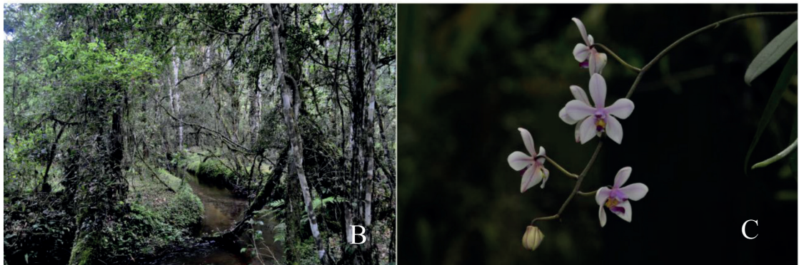
FIGURE 1. A. Distribution map of Phalaenopsis arunachalensis. B. Natural habitat of P. arunachalensis. C. Phalaenopsis arunachalensis in natural habitat showing close up of inflorescence.