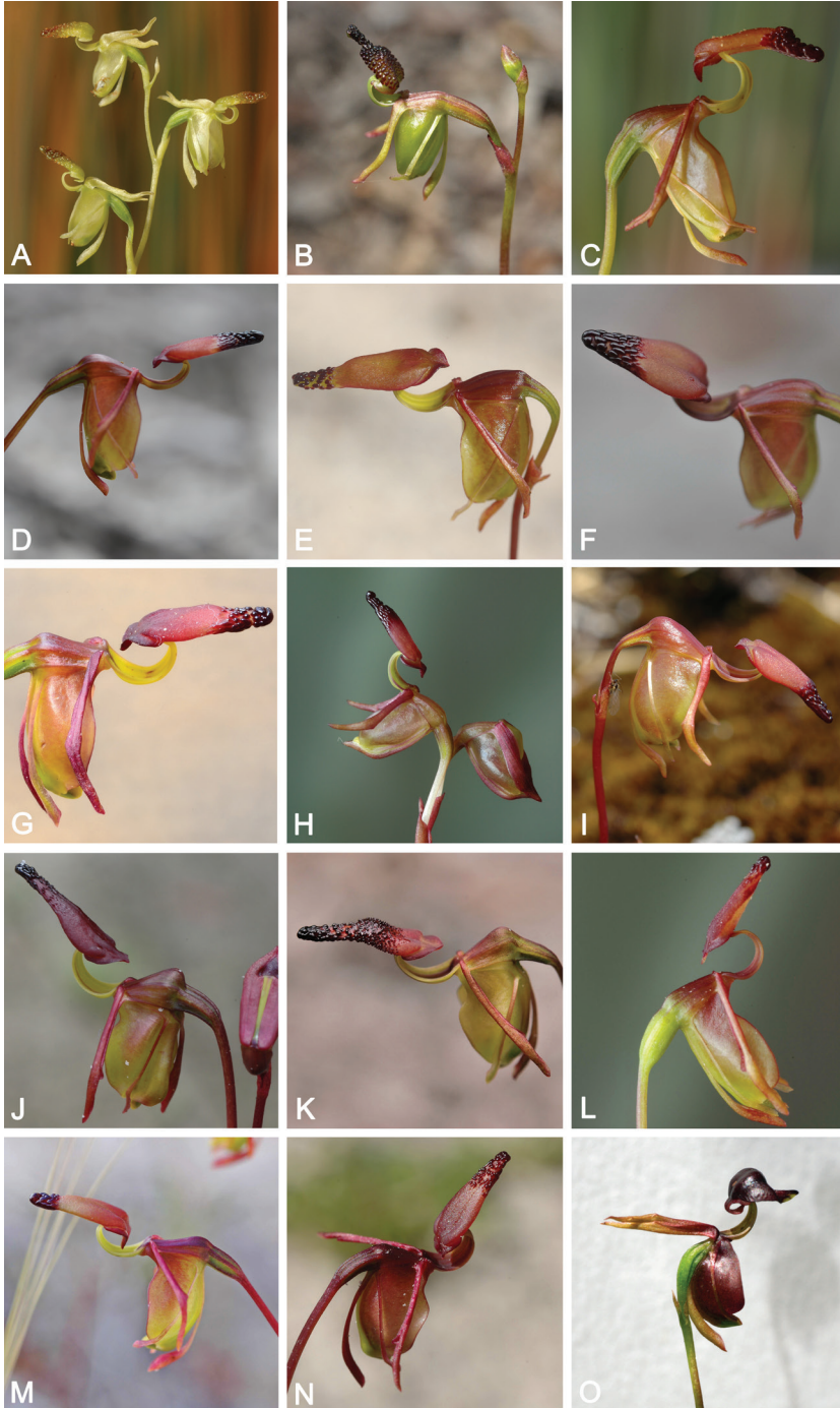
FIGURE 2. A. Sullivania lyonsii. B. Sullivania minor *. C. Sullivania alcockii. D. Sullivania brockmanii. E. Sullivania dixonii. F. Sullivania disjuncta *. G. Sullivania ferricola. H. Sullivania gracilicordata. I. Sullivania granitica. J. Sullivania hortiorum. K. Sullivania nigrita *. L. Sullivania parvula. M. Sullivania terminalis. N. Sullivania triens. O. Caleana major. * indicates species previously transferred to Sullivania but included here for completeness.