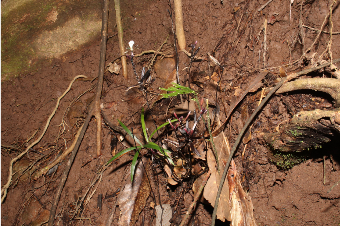
FIGURE 2. In situ photograph of Lecanorchis multiflora showing its habit and habitat.

poaching (Tanalgo 2017). Furthermore, although it is widespread across tropical Asia, the species was found to be quite rare, with less than ten mature individuals found in MTPL. Therefore, following the Red List Criteria of the IUCN Standards and Petitions Subcommittee (IUCN 2019), we proposed this species to be treated as ‘Endangered’.