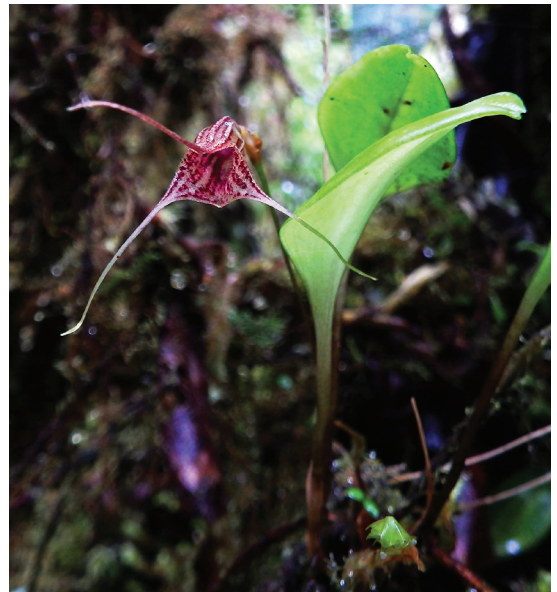
FIGURE 4. Front view of the flower of Masdevallia emieliana .