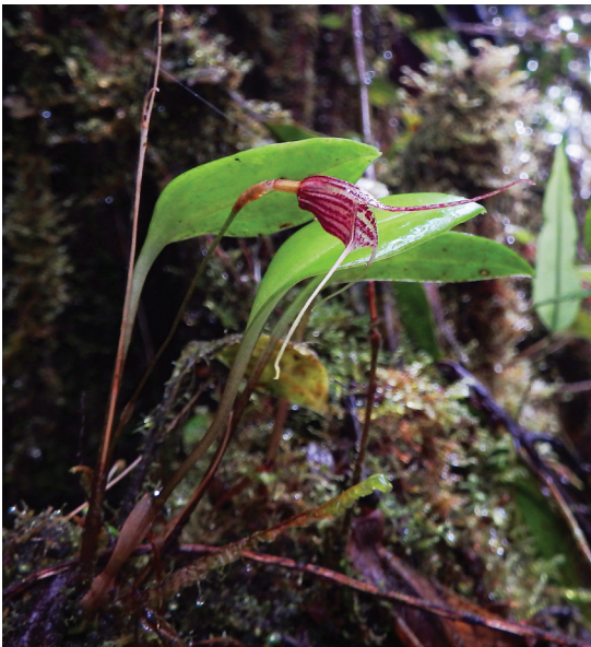
FIGURE 3. Side view of the flower of Masdevallia emieliana .