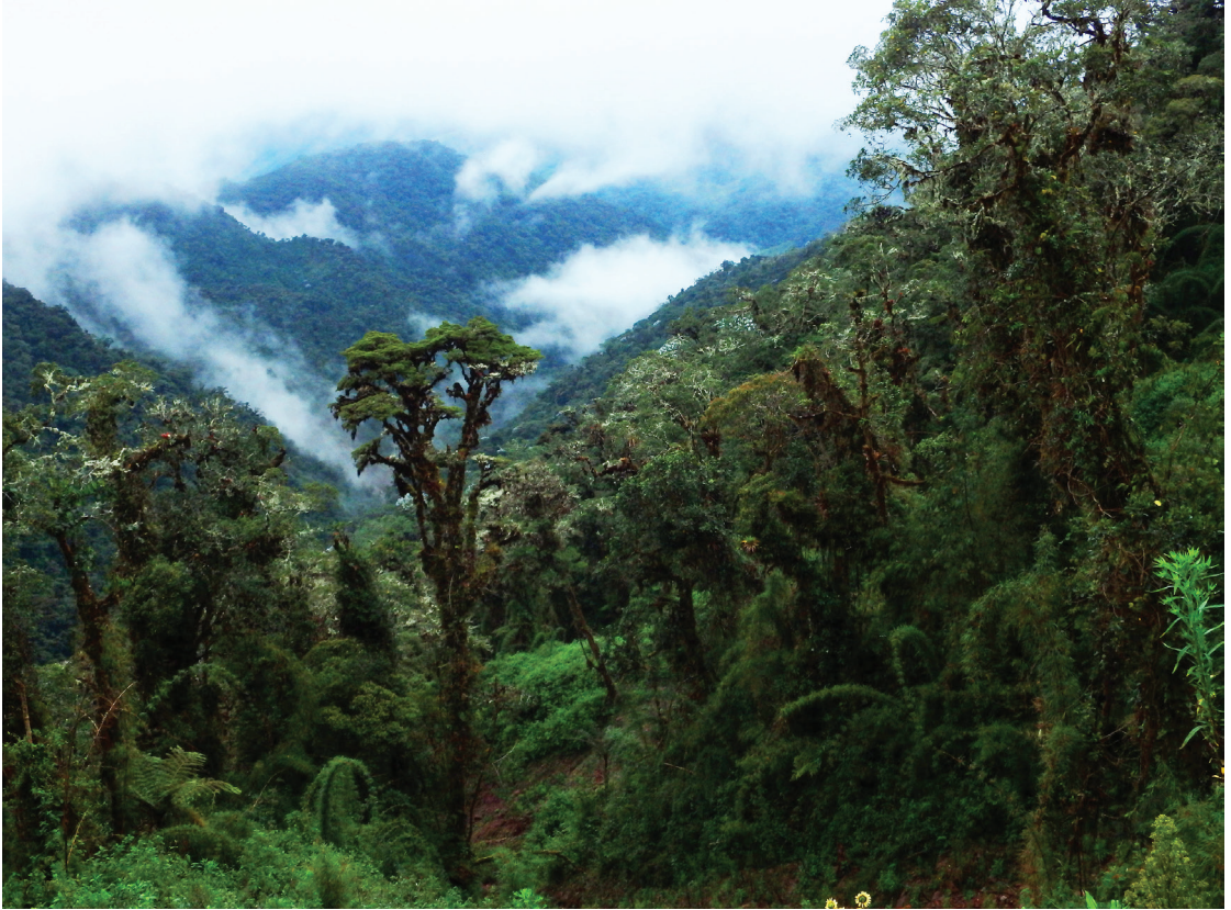
FIGURE 1. The habitat of Masdevallia emieliana in the rich cloud forests of eastern Huanuco.