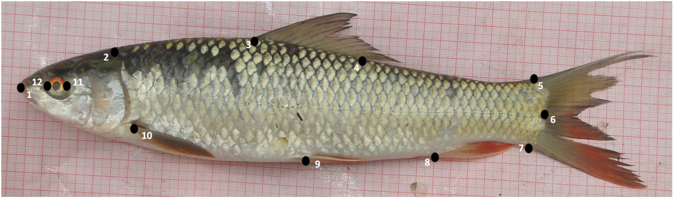
Fig. 2. Locations of 12 landmarks and truss network used for shape analysis. Land marks refer to 1. anterior tip of snout at upper jaw 2. most posterior aspect of neurocranium (beginning of scaled nape) 3. origin of dorsal fin 4. end of dorsal fin 5. anterior attachment of dorsal membrane from caudal fin 6. posterior end of vertebrae column 7. anterior attachment of ventral membrane from caudal fin 8. origin of anal fin 9. insertion of pelvic fin 10. insertion of pectoral fin 11. posterior end of eye 12. anterior end of eye.