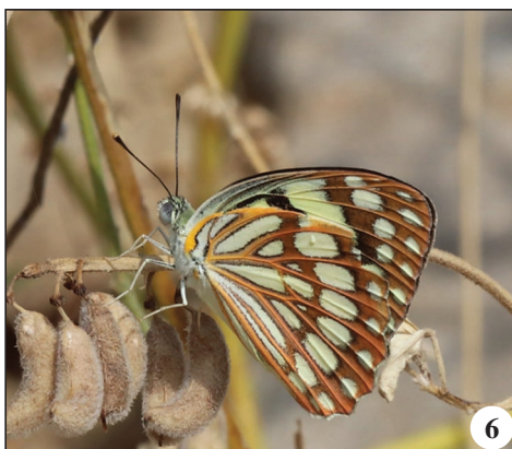
Figures 3-6. — 3. Representatives of the genus Spialia collected in Dhofar: A. Spialia mafa , B. Spialia doris , C. Spialia zebra , D. Spialia colotes . 4. Melitaea deserticola scotti collected by MS in Wadi Sayq in November 2019. 5. Chloroselas esmeralda bilqis feeding on Euphorbia larica Boiss. near Al Mughsayl. 6. Colotis protomedia has so far been recorded only from environs of Dhalkut.