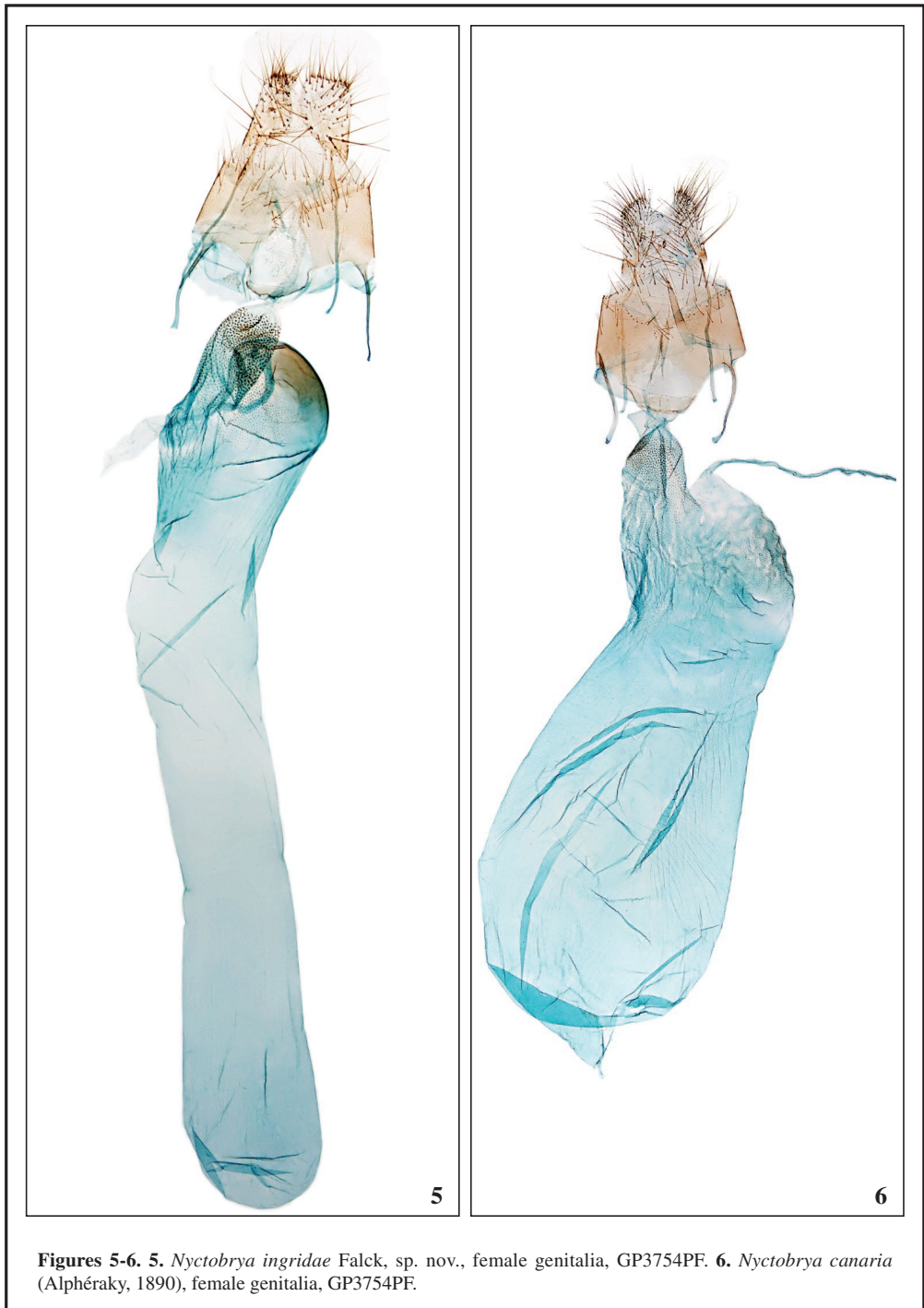
Figures 5-6. 5. Nictobrya ingridae Falck, sp. nov., female genitalia, GP3754PF. 6. Nictobrya canaria (Alphéraky, 1890), female genitalia, GP3754PF.