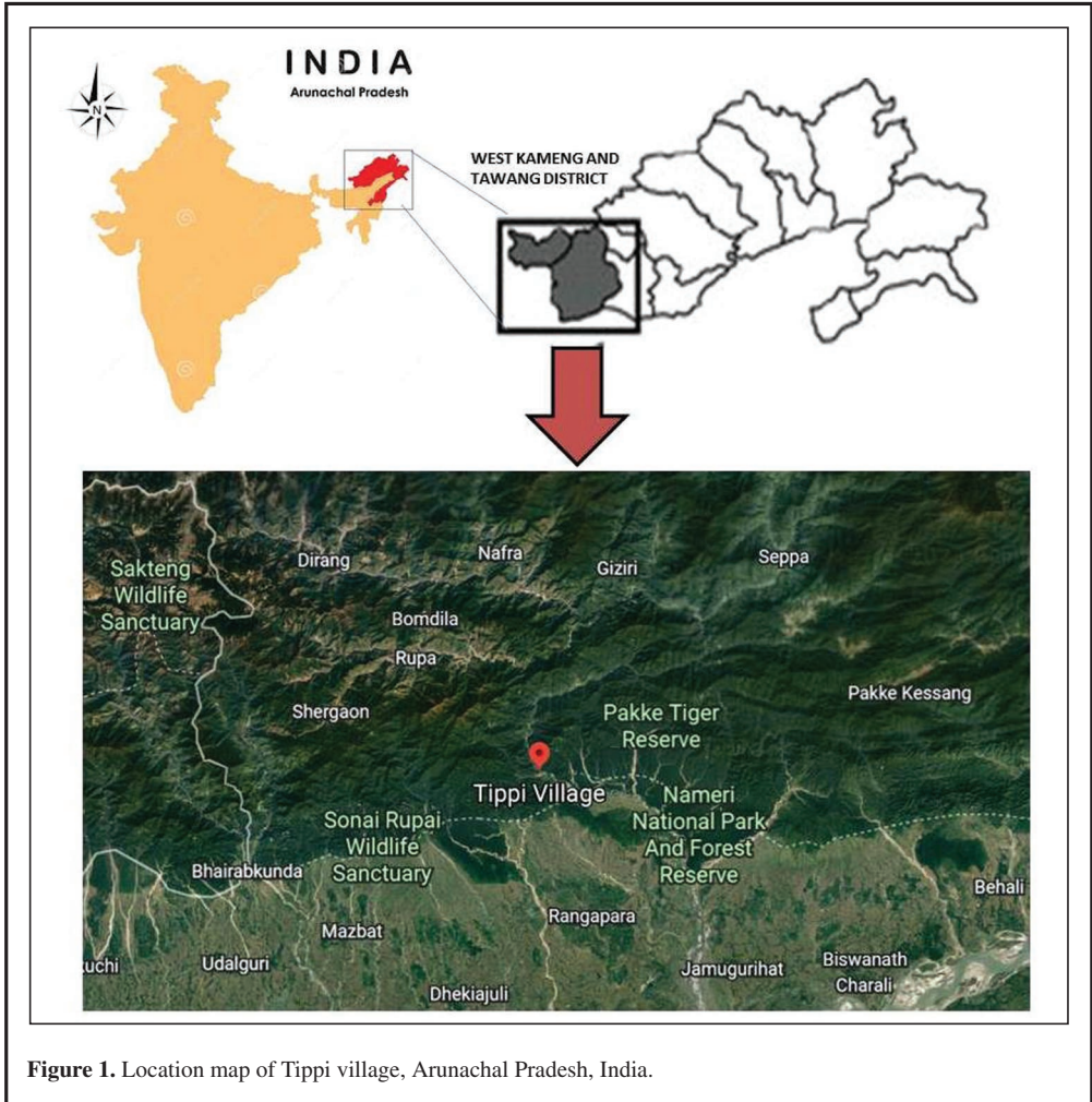
Figure 1. Location map of Tippi village, Arunachal Pradesh, India.

India (Coordinates: Lat. 27.022425, Long. 92.624201; Altitude, 233 m) on 14-IX-2022 during a month-long field visit for documentation of moth diversity in north-eastern India (Figure 1). Tippi is a small village situated on the west bank of Kameng River, adjoining the Pakke Tiger Reserve on the eastern bank of the river. The area falls under the biogeographic zone of ‘Himalayas’ under the Biogeographic Province of ‘East Himalayas (Zone 2D)’ (Rodgers & Panwar, 1988), characterized by a warm and moist tropical climate.