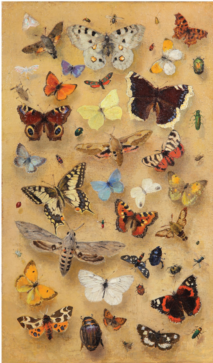
Figure 1. A painting by Vasily D. Polenov entitled “Babochki” [Lepidoptera] (1870s) from the Museum Estate of Vasily Polenov, Polenovo (Tula Region, Russia).