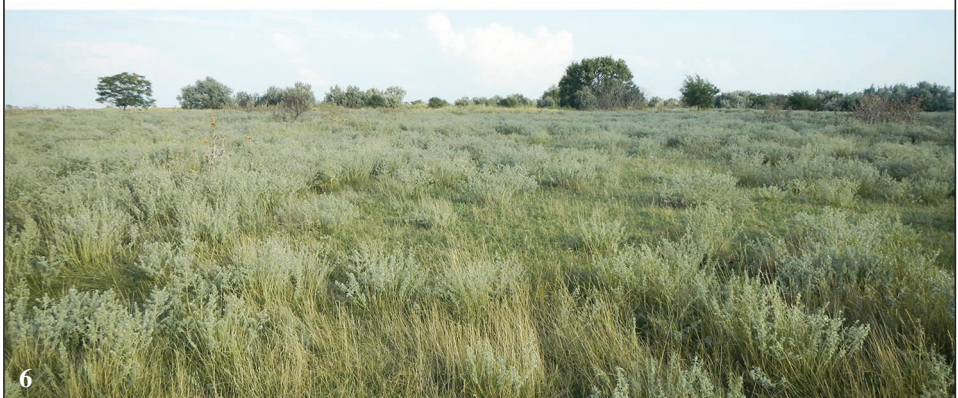
Figures 4-6. Biotopes in Krasnodar Territory where Chamaesphecia efetovi was found. 4. Temryuk District, Taman' Peninsula, western shore of Tsokur estuary, Lysaya Mountain, Yakhno garden (locality [1]), 2022 (photo: K. A. Efetov). 5. Ust-Labinsk District, near Nekrasovskaya village, Laba River valley (locality [3]), 2022 (photo: V. I. Shchurov). 6. Yeysk District, southern shore of Lake Khanskoye, east of Yasenskaya Pereprava village (locality [7]), 2022 (photo: V. I. Shchurov).