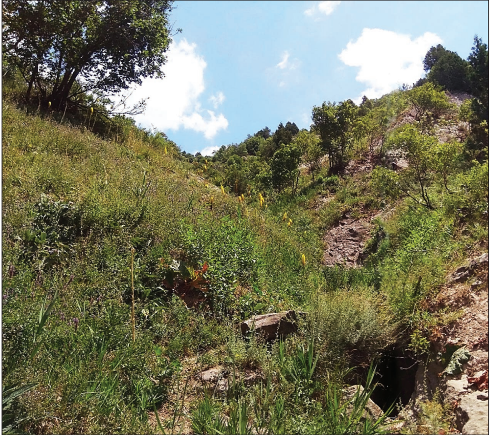
Figure 3. The habitat of N. lunara in the Anjirak gorge, Hazratisho ridge.

Material examined: Peter the Great Mountain ridge, surroundings of the Lyakhsh village, 1 ♂, 2 ♀, 4-VII-2014; Peter the Great Mountain ridge, Hujapulod gorge, 6 ♂, 3 ♀, 12-VII-2014; Peter the Great Mountain ridge, Childara gorge, 10 ♂, 2 ♀, 23-VI-2022; Hazratisho ridge, Anjirak gorge, 3 ♂, 2 ♀, 15-VII-2021, Hazratisho ridge, Anjirak gorge, 18 ♂, 29-VI-2023; Sangloh ridge, 13 ♂, 2 ♀, 5-VI-2023; Hissar ridge, Ramit gorge, 2 ♂, 12-VI-2023 (Figures 3-4).