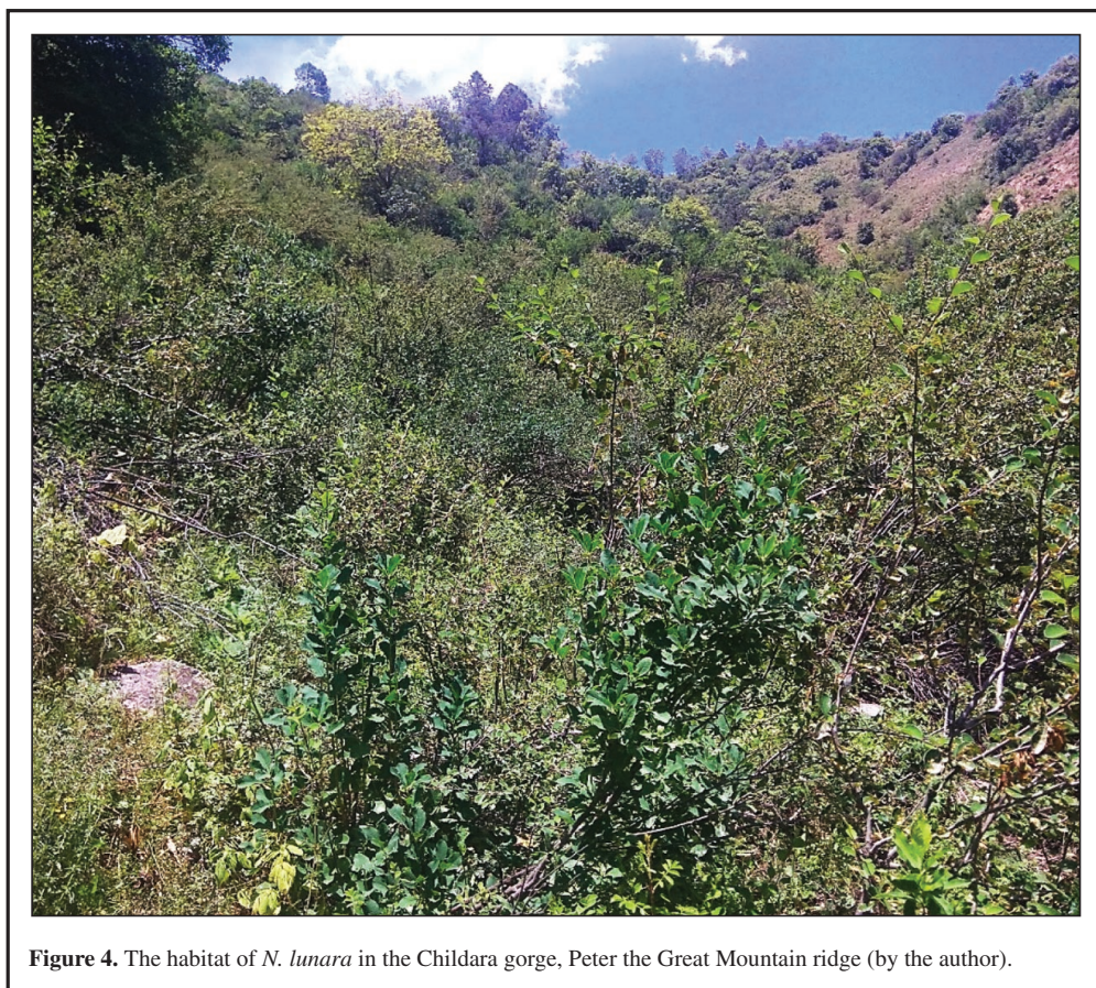
Figure 4. The habitat of N. lunara in the Childara gorge, Peter the Great Mountain ridge.