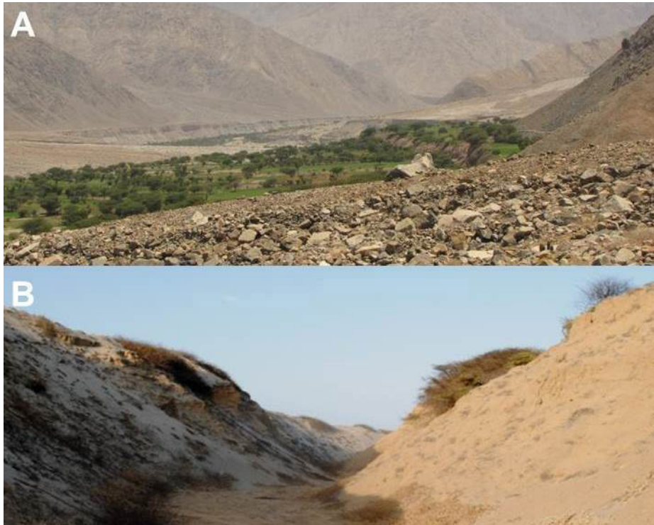
Fig. 4. Landscapes of new records of Tomopeas ravus : A. Ocoña valley, Arequipa, southern Peru; B. Alto Talara, Piura, northern Peru.

notes that most specimens, 30 of 50 examined by her, were captured alike. Therefore, future studies to focus on this species should consider additional methods to the traditional mist nets, like the search for roosts, and acoustic's methods (Jung et al. 2014; Voss et al. 2016).