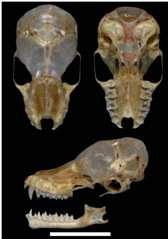
Fig. 3. Dorsal and ventral views of the cranium and lateral view of the cranium and mandible of an adult male Tomopeas ravus (MUSA 14392), collected in Ocoña Valley, Arequipa, Peru. Scale bar = 6 mm.

cords and the present here could be the result of small population size over the past, with a recent recovery. However, it's difficult to know with the information available. In that sense, a long-term study is necessary to explain the temporal population dynamics. Until that, other explanations could be plausible as well, like scarcity of field studies. Nevertheless, this is rebuttable because many areas of Tomopeas distribution have been studied without success in recording it (Graham & Barkley 1984; Hernández-Ríos & Velásquez 1996; AEDS 1998; Zeballos et al. 2000; Zeballos et al. 2002; Mena & Williams 2002; Cadenillas 2003; Pacheco et al. 2007; Montero-Commisso et al. 2008).