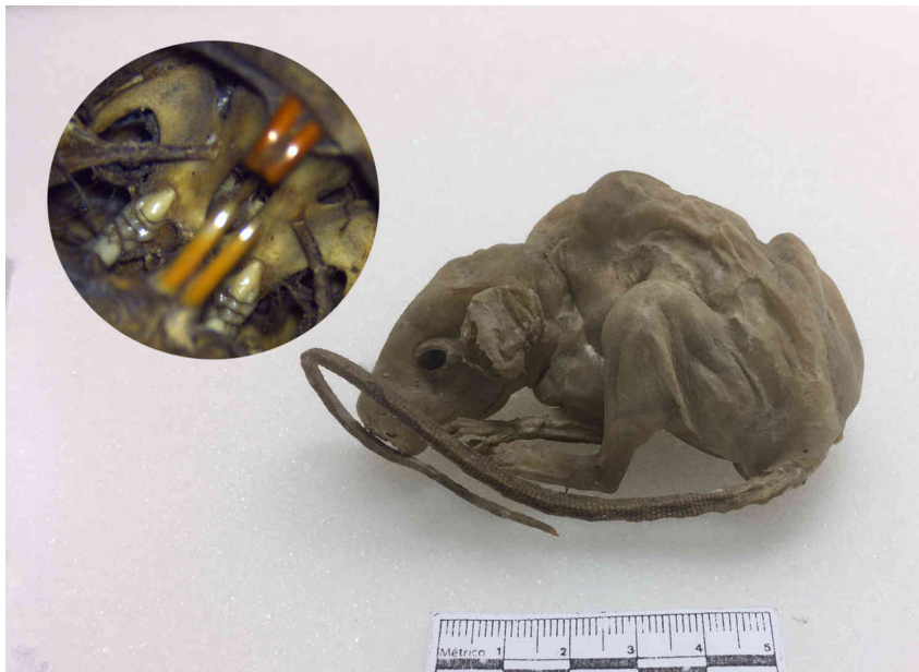
Fig. 2. Mummified specimen of Rattus rattus found at the monastery de la Asunción, Guano, Ecuador. Circular inset: anterior view of the skull depicting the molars with three rows of cusps.