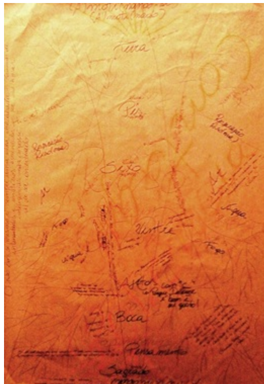
Image 3 Cartography by one of the performers.