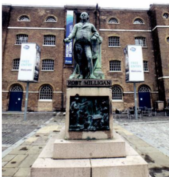
Image 2. Statue of Robert Milligan, London Docklands