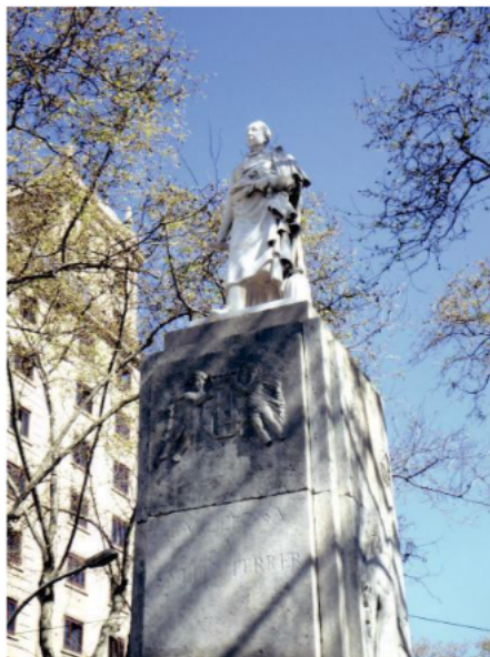
Image 14. Statue of Joan Güell i Ferrer, Barcelona