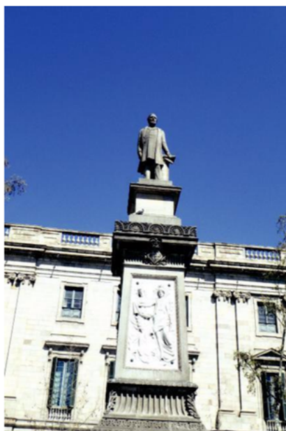
Image 15. Statue of Antonio López y López, Barcelona