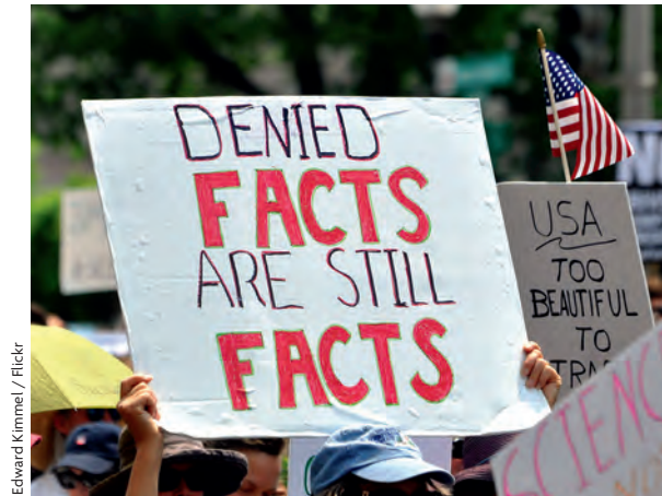
Edward Kimmel / Flickr

Scientific denialism often acts by creating false polemics. One of the current cases of this phenomenon is climate change denialism. In the images, demonstrators of the Peoples Climate March, held on April 2017 in Washington (USA).