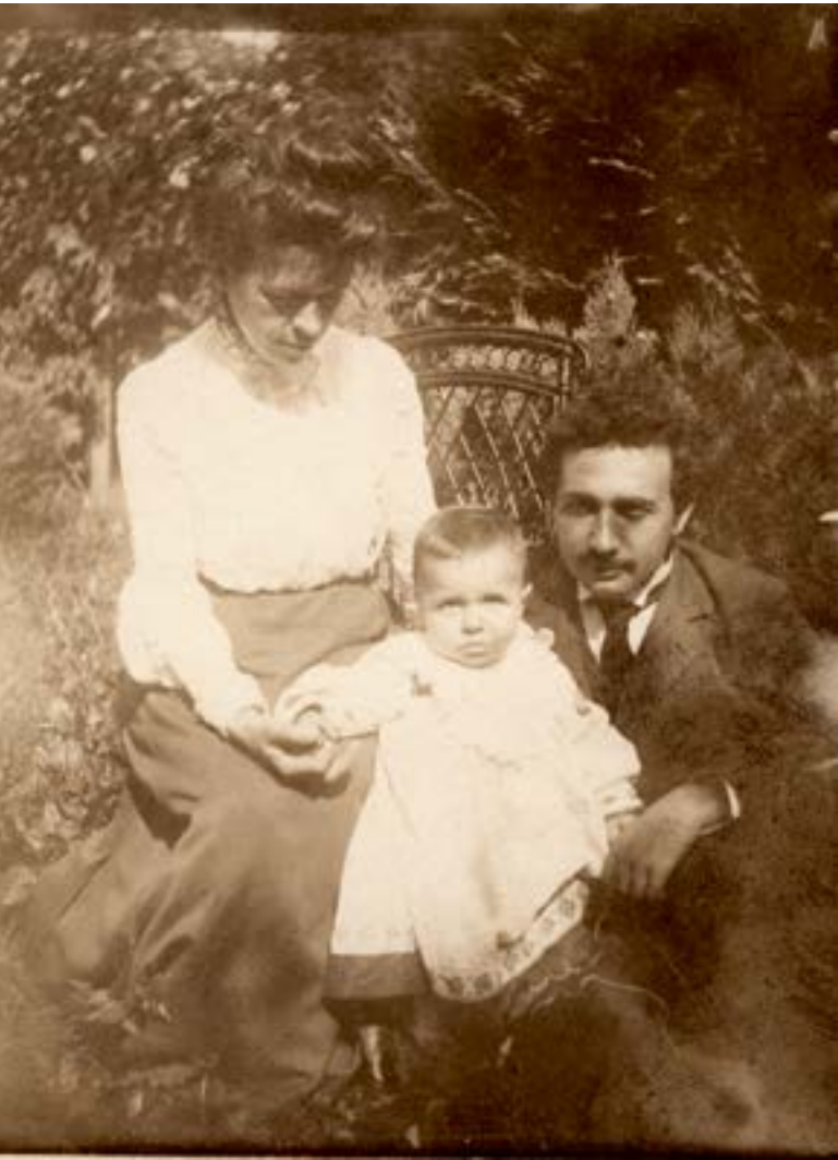
Mileva Marić and Albert Einstein with their son Hans Albert, in a portrait taken between 1904 and 1905. The couple were married in 1903. Some claim that Marić helped Einstein with his physics theories, but these claims are only based on hearsay. What we do know is that Mileva Marić played a pioneering role at a time when women had very few opportunities to receive physics and mathematics training.