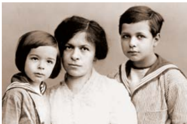
Hebrew University of Jerusalem