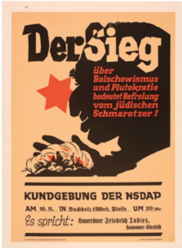
From the mid-19th century, certain biological and medical concepts were increasingly used to refer to Jews, as were comparisons with animals. As early as the 1930s, Nazi discourse incorporated these terms. In the image above, a poster of a Nazi rally reading: «Victory over Bolshevism and plutocracy means the liberation from the Jewish parasites!».

of peoples’) by Walter Schallmayer, who had close ties to the social democrats yet nevertheless was one of the founders of the racial hygiene approach in Germany (Hertz, 1915, p. 19; Thomann & Kümmel, 1995a, pp. 100–107; 1995b, pp. 319 ff.). A similar situation applied to Ludwig Woltmann, who also received a prize. He was associated with social democracy, yet he was also strongly influenced by Gobineau and Chamberlain and in his writings was intensively committed to proving that the Germanic peoples were the most brilliant race in European history (Puschner, 2014, pp. 111–113; Thomann & Kümmel, 1995b, pp. 322 ff.). This development was underscored by the establishment of journals such as the Politisch-Anthropologische Revue/Monatshefte by Ludwig Woltmann in 1902, which developed in a völkisch -anti-Semitic direction even before the First World War, and the competing Archiv für Rassen- und Gesellschaftsbiologie founded by Alfred Ploetz in 1904 (Hufenreuter, pp. 283–290).