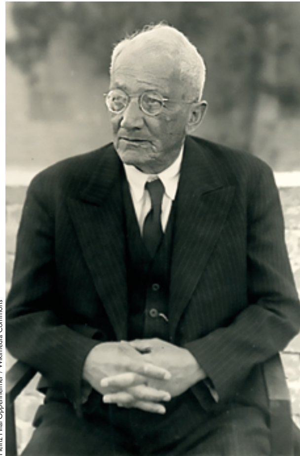
Heinz Hilal Oppenheimer / Wikimedia Commons

The rise of the natural sciences not only laid the foundation for the increasing mechanisation of the economy and society, but in addition, and especially in Germany, it led to the abandonment of speculative natural philosophy and a decline in the importance of the humanities as a whole (Geulen, 2006, p. 103; Thomann & Kümmel, 1995a, pp. 105 ff.). The resulting gaps were filled by movements and groups who saw themselves partly as an expansion of, and partly as a reaction to,