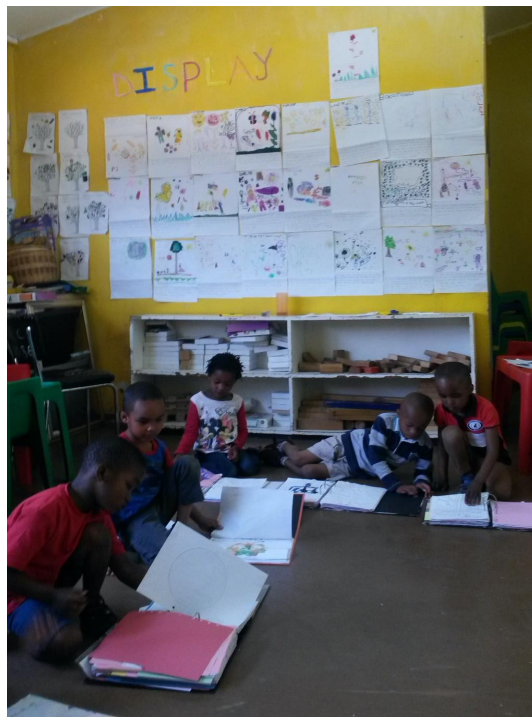
Figure 9: Children filing, sorting their own work/pedagogical products.

The teacher becomes ‘smaller’, by giving up her control over the children’s files. The children manage their pedagogical products and live skin-to-skin with the growing record of their year in the class. This lively intra-action of spacetime-mattering sets off new reverberations. The events in the park have produced a story of a little tree that may be misread as a charming and endearing allegory of childhood, but which has implications for how we carry on as humans in relation with our shared worlds. True stories of precarity and destruction haunt our every moment and demand a new ethics of engagement.