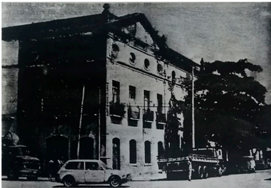
Figure 2. Pensão Convento in the 1980s

a “real estate agent” or a “large real estate” (interviews held on October 16 and 25, 2017, with a resident of Bairro do Recife, and on October 21 and 30, 2017, with a City Hall technician). This last interviewee stated that: “I joke a lot with the people from Porto Digital, which is no longer Porto Digital, it’s the Digital Monopoly . Because they’re buying everything, spreading out ... they’re already in Santo Amaro”.