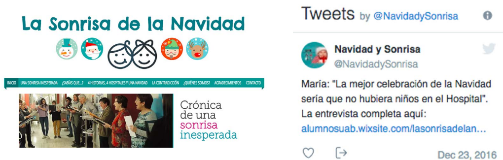
Figure 1: Screenshots of the webpage and Tweets from: “The Smile of Christmas”, done by students.

Despite the fact that interaction and conversation generated by platforms is one of the main elements of transmedia (Alzamora and Tárca, 2014; Dawson and Siemens, 2014), students in the focus group pointed out that they prioritized content and aesthetic design of websites ahead of interaction. The results also show that only 21% (6) of the reports promoted interaction with the audience. For example, some projects encouraged the audience to submit their own Christmas photos 8 , following the crowdsourcing trend (Moloney, 2011; Carniel Bugs, 2014): Others allowed the audience to express their voice through surveys 9 , encouraging comments from readers on Facebook 10 , or the verification of Christmas lottery numbers by Internet users 11 . The presence of social media and platforms is significant, led by YouTube (54%), Twitter (39%), Instagram (11%) and Facebook (4%).