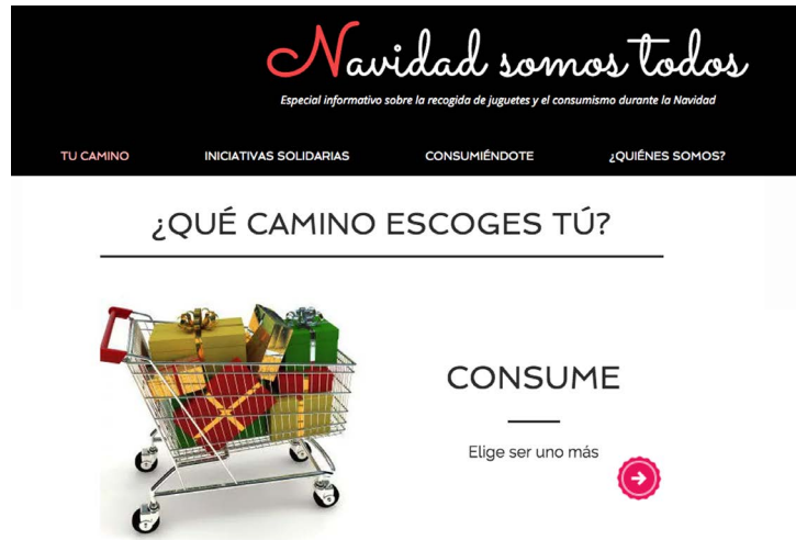
Figure 2: An example of immersion: “Your path” and “We are all Christmas”, done by students.

Students in the focus groups recognized that carrying out the project allowed them to develop a sense of the aesthetic with regard to transmedia literacy and to discuss its representation in groups. Although their projects do not indicate high levels of innovation in the gestation of their ideas, students carried out important work in the design of their websites, as well as in the creative assessment of their group discussions.