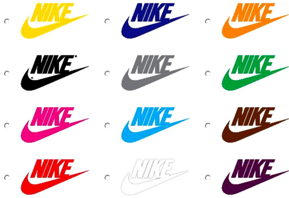
Fig. 1. Brand priming manipulation.

suspicion regarding this first stage's purpose. These two other brands were Sadia and Havaianas. Fig. 1 shows an example of the stimulus for the brand priming manipulation: