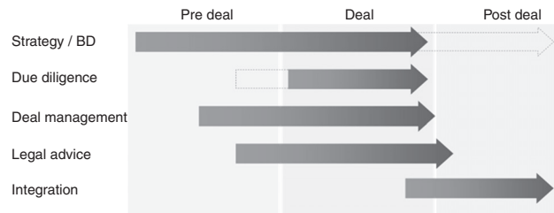
Fig. 1. The deal cycle.

The aim was to investigate the entire deal flow and to understand the correlation between different dialogs, as well as between different viewpoints. The sample was firstly divided