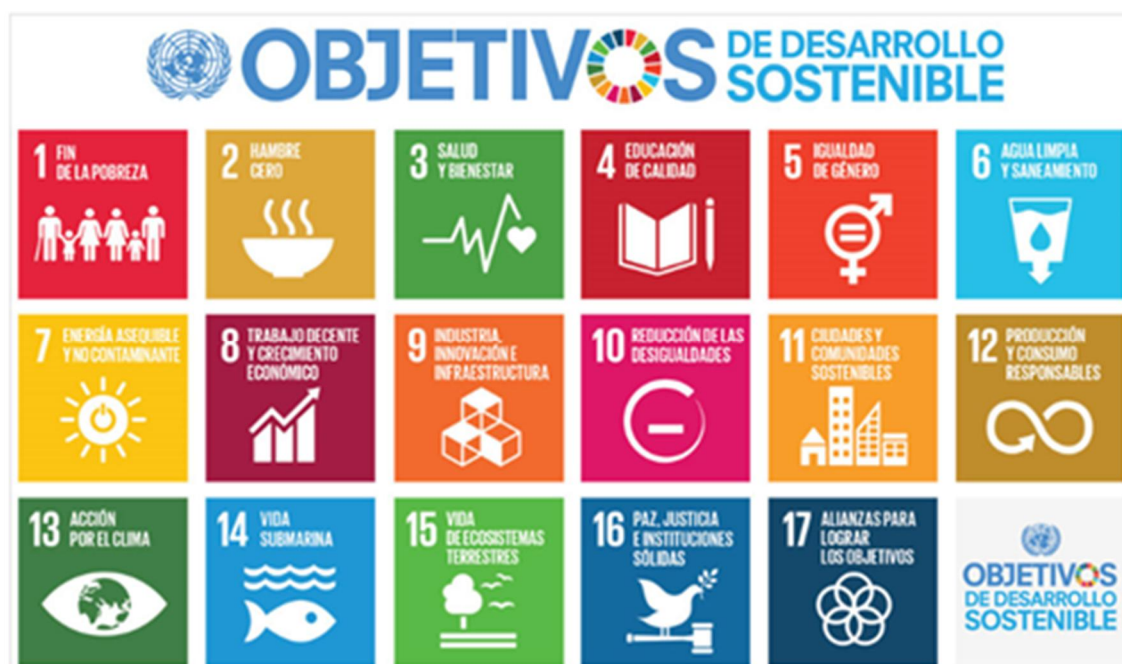
Figure 4. Sustainable development goals. WHO, 2016. (25)