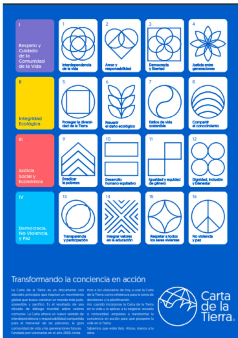
Figure 5. Poster of the Earth Echarter. The sixteen actions that the letter proclaims are graphically summarized. UNESCO and the IUCN (World Conservation Union). www.earthcharter.org . www.cartadelatierra.org

However, we are also afraid that unfortunately, in a few weeks, when the fear of the coronavirus stops us from “clenching our throats” and the desire to continually talk about the pandemic and the lies and truths of this reality is extinguished, everything will return to silence. We are afraid that everything will return to the sad reality of selfishness, to which we cling upon also hope that soon enough, the clouds will open on the horizon, and those who keep the illusion and the desire to fight for a better world will be illuminated by the Earth’s Charter. Remembering the words of Miguel de Cervantes (free translation): “ Know that all these storms