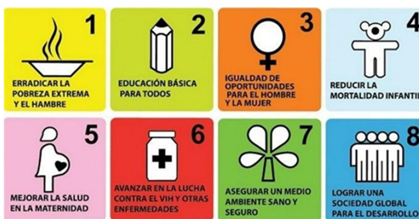
Figure 3. Millennium Goals, WHO, 2000. (24)

Echarter also includes a message and a poster that brings together its most important values of solidarity, respect and good work, that are in tune with the goals of the 2000 millennium and the goals of a caring world 2015 (Figures 3-5), which invites us to nurture from “otherness”. There is no doubt that this letter to Earth that requests our help to make the world more sustainable, promotes the fight against climate change and the challenges of anthropocene, (23) which as we have seen are directly related to new pandemics, such as SARS-CoV-2/COVID-19.