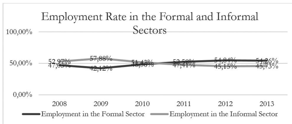
Figure 5: Figures the employment rates per sector in Ecuador (2008-2014)

The Buen Vivir could be perceived as a socialist model, which pursues to improve the standards of living of the Ecuadorians by reducing poverty and redistributing the wealth by creating pro-environmental and sustainable policies (SENPLADES 2009). The results of the Buen Vivir model, until 2014,