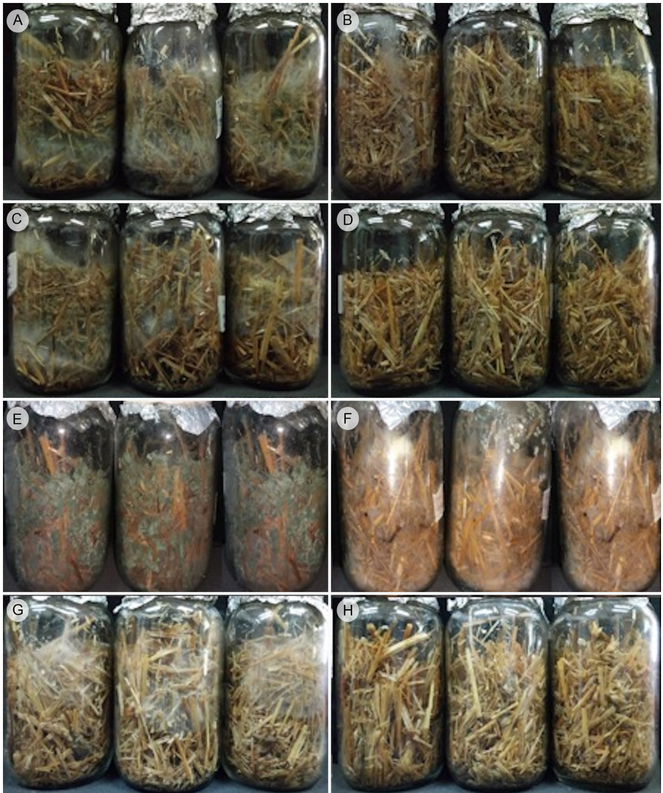
Figure 3: Growth of strains Tr1, Tr5, Trichoderma aggressivum Samuels & W. Gams and Pleurotus ostreatus (Jacq.) P. Kumm, without (A, C, E and G, respectively) and with (B, D, F and H, respectively) the addition of the extract of Pycnoporus sp. (Polyporaceae).