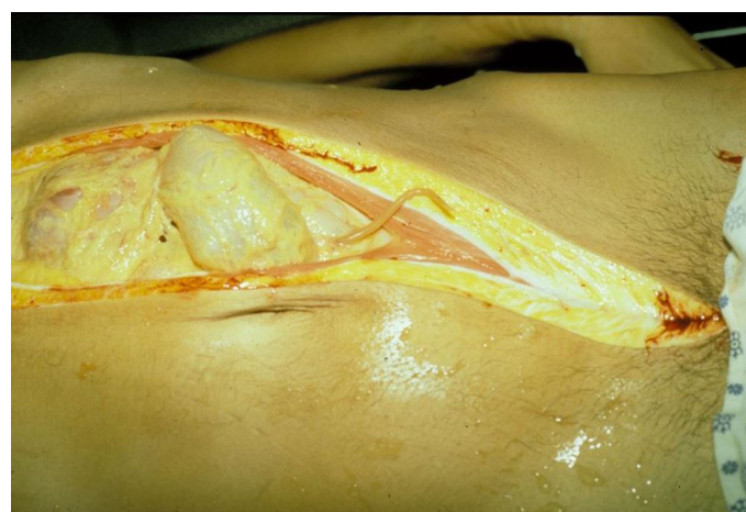
Figure 1. Ascaris emerging from inadvertently opened jejunum.

At this point in the autopsy, the inexperienced pathologist proclaimed to the autopsy assistant that he had found the cause of the anemia. The autopsy assistant was from a region with a wide variety of helminthic diseases, and he informed the pathologist that the cause of the anemia had not been found because ascariasis does not cause anemia. Opening the colon, however, revealed extensive trichuriasis,