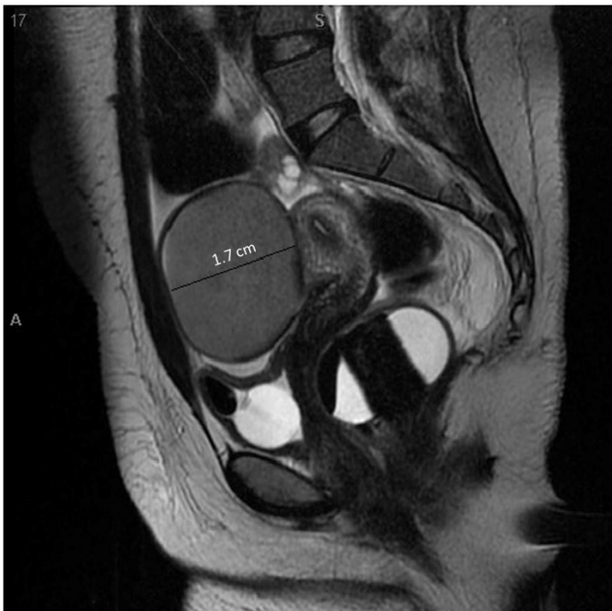
Figure 1. Pelvic MRI scan (T2 weighted image) in the sagittal plane showing the right.

cut surface with attached dark brown hair. On the histology, the mass in the right ovary revealed a mature cystic teratoma (Figure 2).