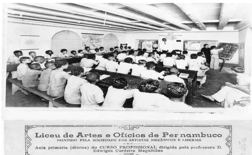
Figure 04 – Primary lesson.

The 'color' relationship of those future workers students, would have been decisive in their life experiences. Our documentation is insufficient for the Lyceum Black student's life trajectories analysis. We are only with these photographs and its tracks.