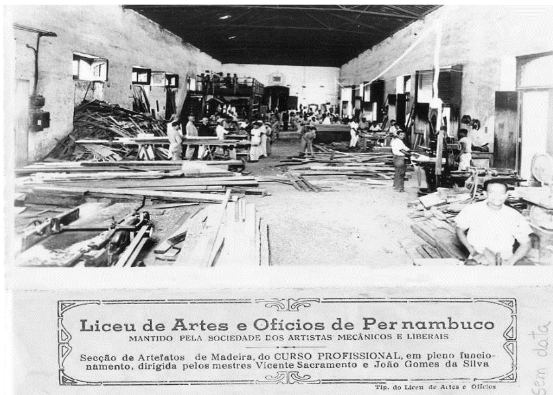
Figure 03 – Wooden Devices session.

In a great shed in functioning, in the full light of day, students with diverse tones of skin and ages participated in the Lyceum carpentry workshop, under the supervision of 'masters' Vicente Sacramento and João Gomes Da Silva (Figure 3). In this photograph, the intention seems to emphasize the space range destined to the learning of the carpentry, and not the students' specific activities. In the foreground, there is only raw material and an isolated student on the right, working in one of the tables or workstations. In the second plan, there are the masters with younger and older students, in the chore with the machines and woods. In the background, the third plan, a great number of students in what seems to be other workstations (as that one where was the isolated student in the foreground), giving the impression of being a great space, aired and well illuminated (with the light emanating in such a way of the great windows on the right about the dumping wagons to the left), it also counted on a mezzanine, in the background, on the left. In the craft education, the relation between master and apprentice demanded direct contact with the practical 'labor' to be exercised. Although we are not able to see with clearness, this photograph seems to show the students direct contact with carpentry, for example, indicating that the education was guided by practice.