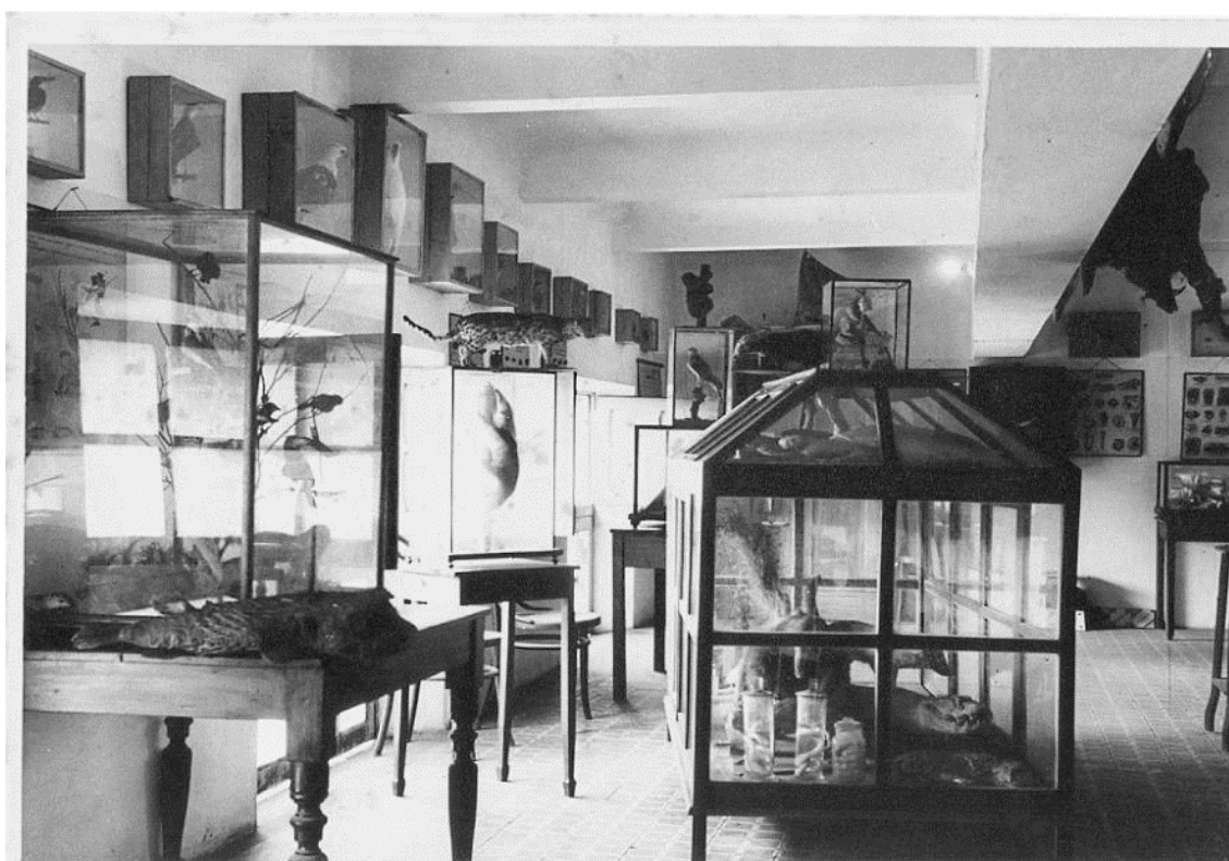
Figure 05 – Lyceum's Museum.

Diana Vidal mentioned the circulation of 'lessons of things' between Brazil, Portugal and France, during the nineteenth century. The objects flow, people and teaching methods were an effect of the societies, cultures and industries increasing internationalization (Vidal, 2017). If we take into account this Vidal definition, the Lyceum wanted to demonstrate, in the photographs, that it was articulated, within its possibilities, with what was most modern in the world.