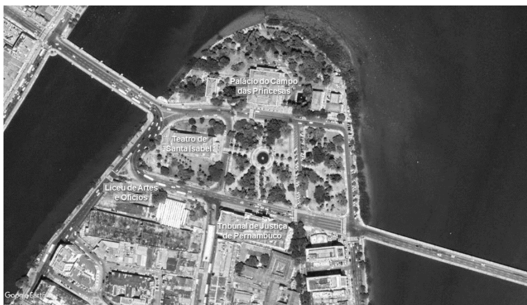
Figure 06 – Santo Antonio district high plan view.

Currently, in the Lyceum small palace there are not any classes. The classes were transferred to an old Jesuit school, the Nóbrega, in front of the Catholic University of Pernambuco, which started to manage the Lyceum. The Figure above (Figure 06) shows the social space in which the institution was constructed. The small palace, in 1880, lied in the 'core' of the provincial elite building, in front of the Santa Isabel Theater and to the Princesses Field Palace - the province administrative center later Pernambuco state. To the Lyceum's side, it is the Justice Court of Pernambuco constructed in 1930. The Santo Antonio district architectural complex keeps close relations with the pernambucano 'white' manorial/ colonial past. The Friburgo Palace, place of dutch administration in the old captainship was constructed during the Maurício de Nassau government and it was demolished in the nineteenth century (Cavalcanti, 2009). Built for black and medium brown craftsmen, in a historical' and administrative place (and 'white'), the Lyceum locked up part of the work aristocrats' trajectory, cementing their construction of social prestige.