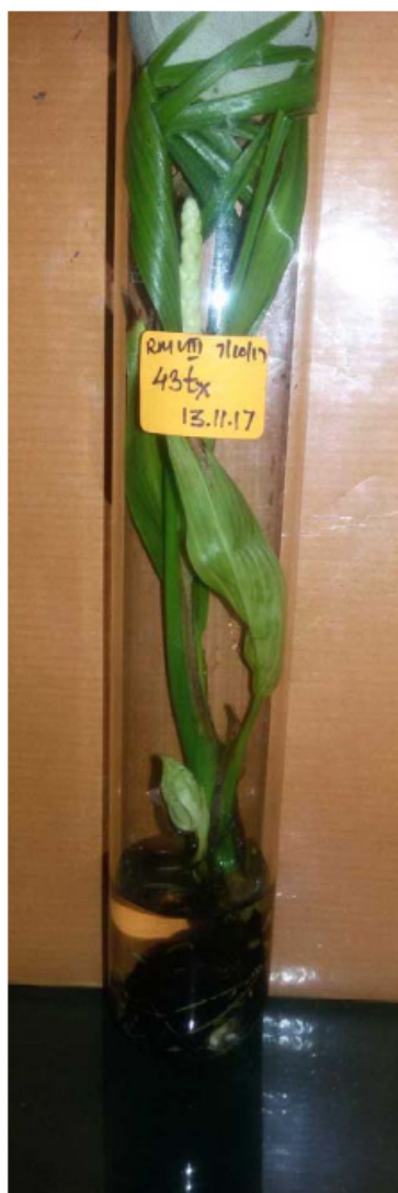
Fig. 1b Fully emerged in vitro inflorescence

It was interesting to note that in vitro flowering did not resemble flowering ex vitro, in that the inflorescences in vitro never matured and they subsequently senesced indicating that other factors, excluding cytokinins and a carbohydrate source, are required for continued normal development of the inflorescences. Cytokinins and sucrose therefore seem to act in the initial stages of floral initiation and development, however, full differentiation and maturation of the resulting flower bud requires involvement of other physiological factors.