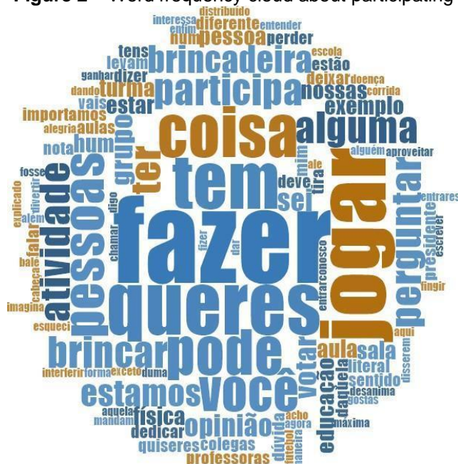
Figure 2 – Word frequency cloud about participating