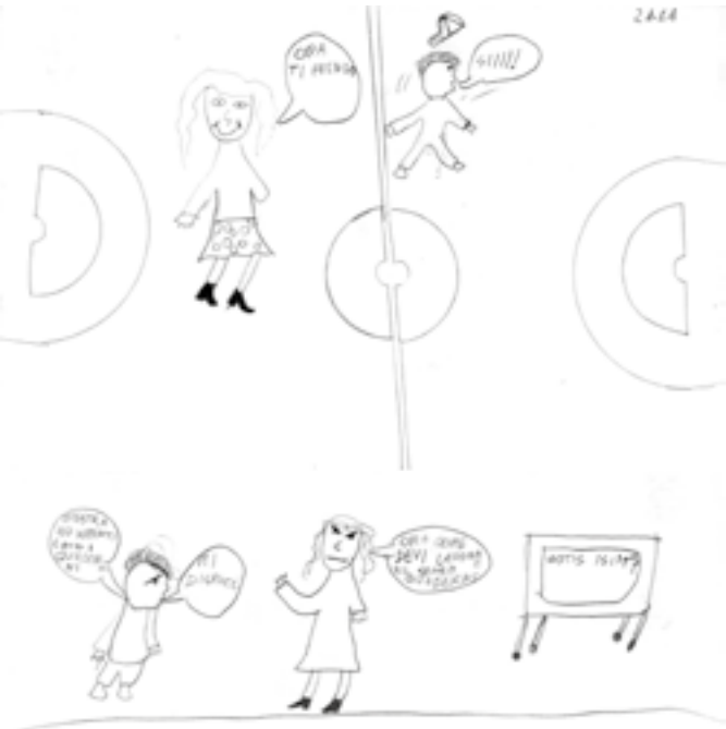
Figure 2. A Boy's (2nd grade) Drawings. P drawing (left): Special Moment; Teacher "Now I will catch you"; Child: "Yesss! N drawing: Interpersonal Exchange; Child: "Teacher, I forgot the notebooks"; Teacher: "Now you have to work without the notebooks"; Child: "I'm sorry."

The contingency coefficient, calculated on the data of Table 1, was significant (0.38, p < .001 ). In fact, in 106 cases (43%) children chose to contrast a negative and a positive version of the same situation, especially school success in P and failure in N (category 3) or exchange of affection in P and reproach in N (category 4). However, there were many exceptions (as also evident in Table 1):