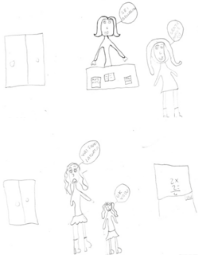
Figure 6. A Girl's (2 nd grade) Drawings.

celebration or a field trip (P drawing in Figure 4); excellent School Results (P drawing in Figure 3); smiling faces, words or gestures of affection in the Interpersonal Exchanges (P drawings in Figures 6 and 7). In N drawings, we found, respectively, upsetting Special Moments, such as a pupil complaining about extreme boredom (N drawing in Figure 5), failures or bad grades in School Results, Interpersonal Exchanges characterized by unhappy or angry faces (N drawings in Figures 2 and 3).