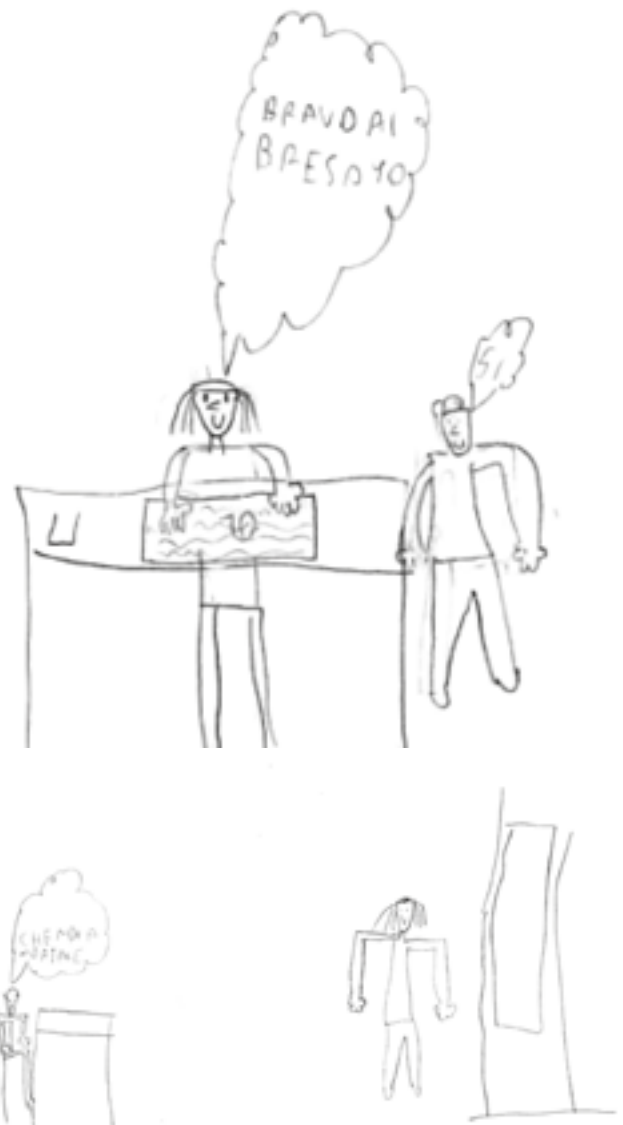
Figure 5. A Boy's (2 nd grade) Drawings. P drawing (left): School Result; Teacher: "Good, you earned 10"; Child: "Yes" N drawing: Special Moment; Child: "What a mortal boredom."

We think that the contrastive procedure, in conjunction with the task presentation as a means of communication with the adult experimenter, helped children to focus on relevant instances of their relationship with the teachers with whom they spend more hours in school. This procedure is suggested as a basis for a valid use of drawing in quantitative research (Burkitt, 2017) and confirmed as very useful also in different theoretical frameworks such as that adopted by Maxwell (2015). In fact, in our study, only 9 children failed to differentiate the P and N drawings, representing both as merely an Ordinary Activity, that is, without any specific indication of the quality of their ongoing relationship with the teacher such as children sitting at their tables (as in the N drawing of Figure 4) or standing in front of the teacher for an oral test (as in the P drawing of Figure 1).