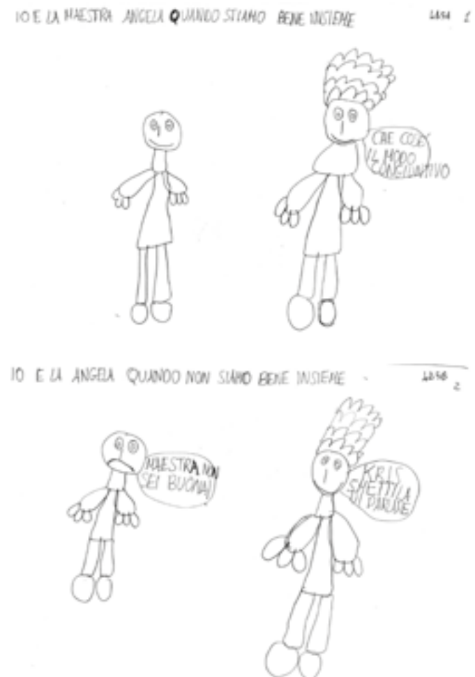
Figure 1. A Boy's (4th grade) Drawings.

garden, going to a school trip) while bothering and sad in the N drawings (e.g., visiting the cemetery, being hurt while playing in the garden, sitting in class but not working). School Result always included school activities and/or evaluations in which P drawings typically reported successful performances and positive grades, while N drawings reported failures and bad grades. Finally, the Interpersonal Exchange category was represented by expressions of affection or shared joy in the P drawings as opposed to reprimands, bad behavior, shared sadness, or upsetting emotions (teacher's anger vs. child's sadness) in the N drawings.