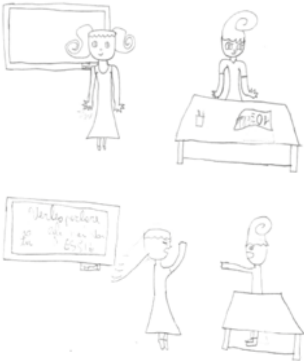
Figure 3. A Girl's (5th grade) Drawings. P drawing (left): School Result; on the notebook: "10 with laude" [the best grade in Italy] N drawing: Interpersonal Exchange; on the blackboard: a grammar exercise. Teacher's figure on the left in both drawings.

The frequencies of the categories in the P and N drawings were compared by gender and by school grade, combining the participants into two groups (lower grades = 2nd and 3rd grade; upper grades = 4th and 5th grade) to avoid small numbers per cell. Significant differences of gender emerged in P drawings, gender: \chi^2(3) = 13.35, p = .004 , in which boys represented a successful School Result more often than girls; these latter, on the contrary, portrayed a warm Interpersonal Exchange more often than boys (see Figures 6 and 7). In the N drawings, instead, boys and girls alike concentrated on difficult Interpersonal Exchanges, gender: \chi^2(3) = 1.11, p = .775 .