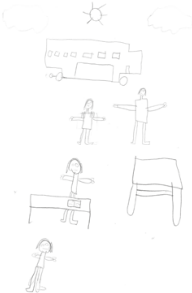
Figure 4. A Girl's (3 rd grade) Drawings. P drawing (left): Special Moment N drawing: Ordinary Activity.

having more Affection than children who represented an Ordinary Activity; children who represented a Special Moment or School Results received intermediate Affection scores. For Insecurity means (Ordinary Activity = 3.46, Special Moment = 3.57, School Result = 3.50, Interpersonal Exchange = 3.89) the post hoc comparisons showed that children who portrayed a P situation as involving a warm Interpersonal Exchange were perceived by teachers as more insecure than all the other children.