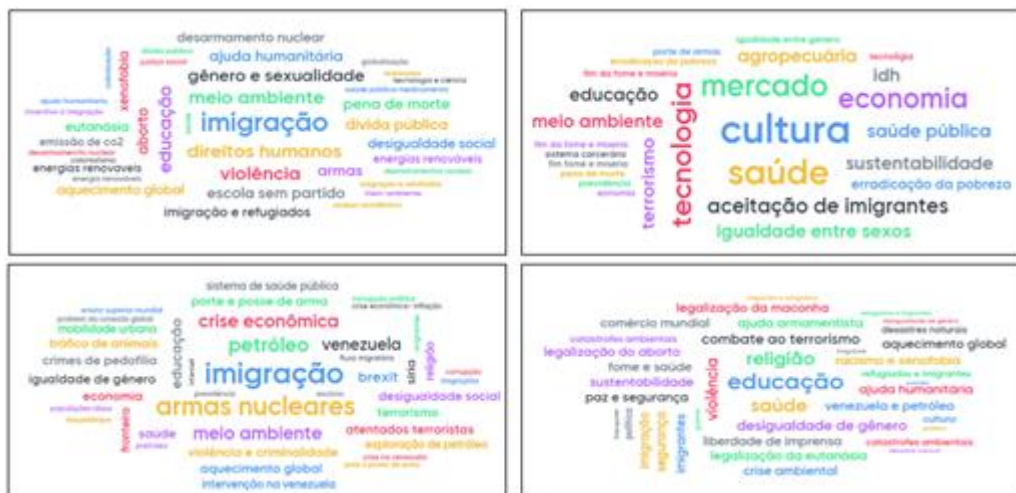
Figure 01 - Word Clouds produced by students in the classroom

Many subjects arose in each of the four high school 3rd grade classrooms of the school where the research took place and they needed to be delimited so that we could reach the most relevant subjects for each class. The teacher asked everyone to use their cell phones to vote on the three most important issues for each group (delegation) using the Mentimeter tool 9 , answering the question previously made available on the tool by the teacher: “What are the 3 most important issues for you today?” The responses were analyzed and the tool itself generated, in real time, word clouds that came to represent the profile of interests in each room, which could be viewed by each student on their “smartphone” and projected by the teacher in the classroom. room screen, as shown in figure 01, below: