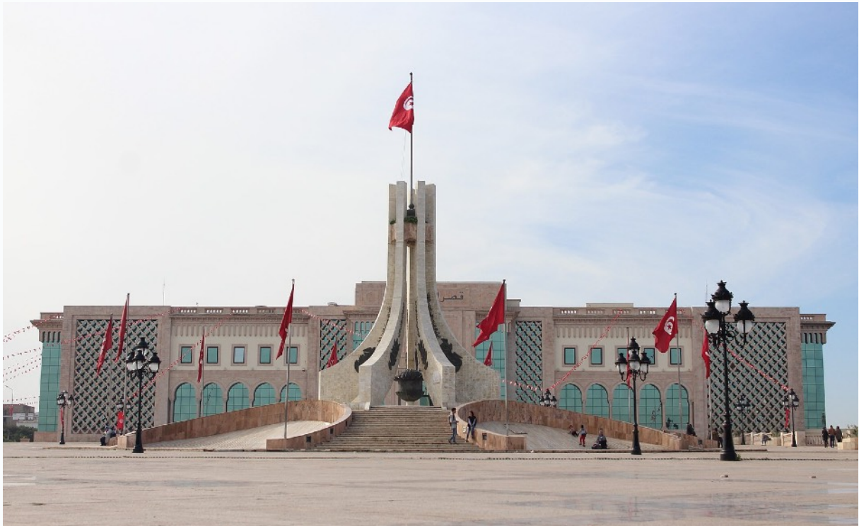
Figure 2: Kasbah Square (Tunis Town Hall) . CC BY-SA 4.0, photographed by Sami Mlouhi.