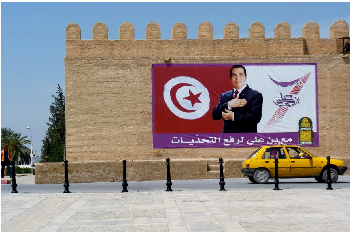
Figure 3: Banner of President Ben Ali in Kairouan.