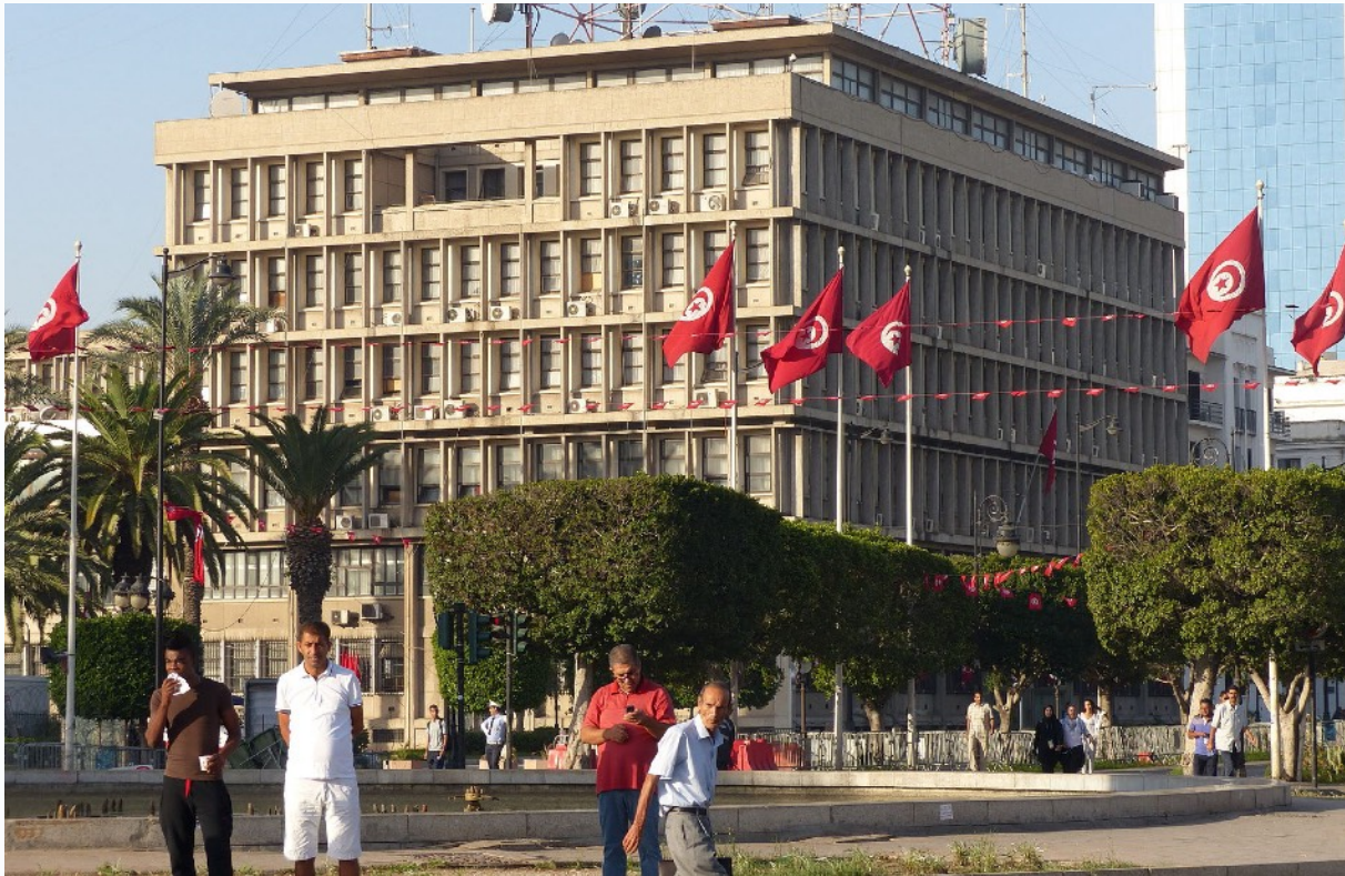
Figure 1: Headquarters of the Tunisian Ministry of the Interior overlooking Avenue Habib Bourguiba.