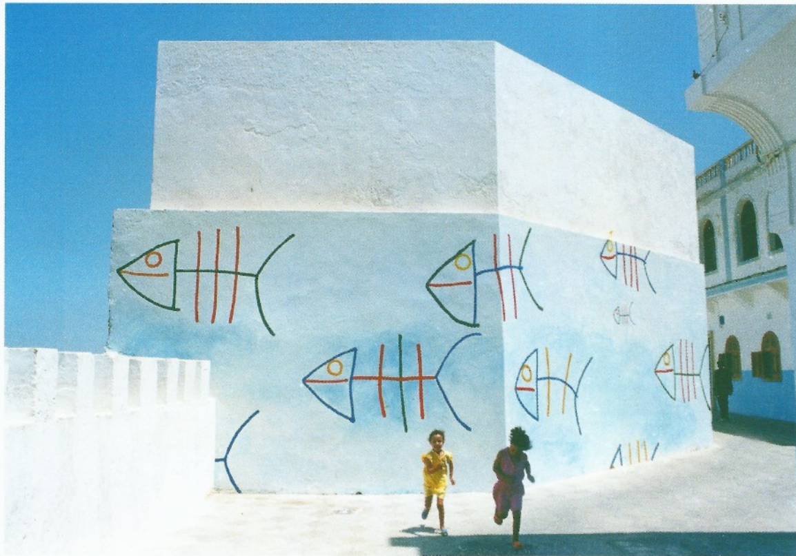
Abdelkrim Ouazzani (Maroc) 1994