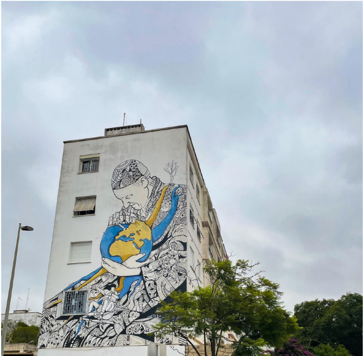
Figure 9: Mural by Kalamour, Jidar, Toiles de rue Festival Rabat 2015.