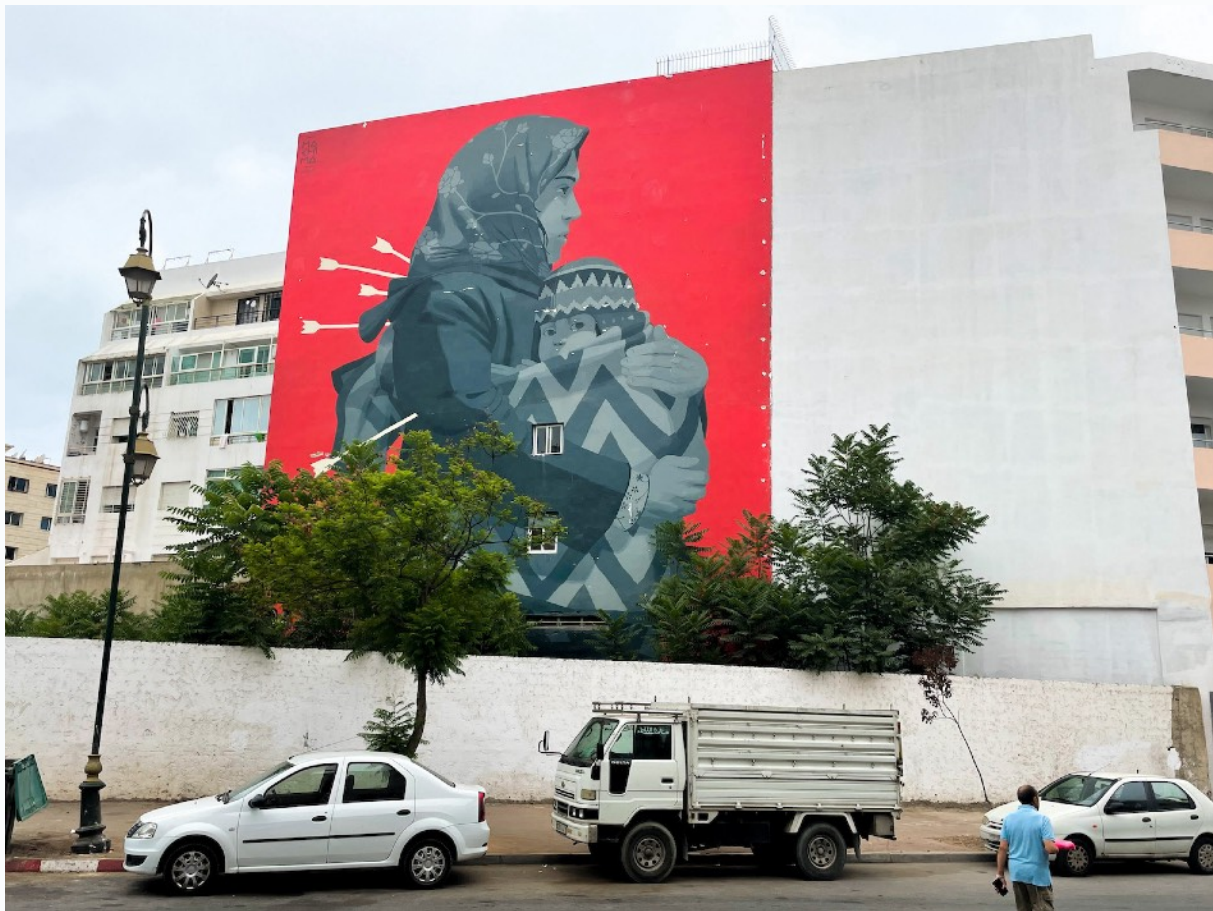
Figure 10: Mural by Machima, Jidar, Toiles de Rue Festival Rabat 2019.

These recent festivals demonstrate that a young generation of artists is operating independently of the generation that constituted the artistic avant-garde in the 1960s, cooperating in a pragmatic rather than political way with state structures, and significantly integrating themselves into transnational artistic milieus. Unlike the older generation, these young artists seek to enforce transformations in the urban context in relation to specific issues of particular neighborhoods and social groups, requiring a self-reflexive engagement with particular historical, social, or environmental aspects of the city. Street art is able to interact directly with the urban space and its inhabitants, but for this very reason it is also especially subject to social control or political appropriation, commercialization, or cultural marketing.