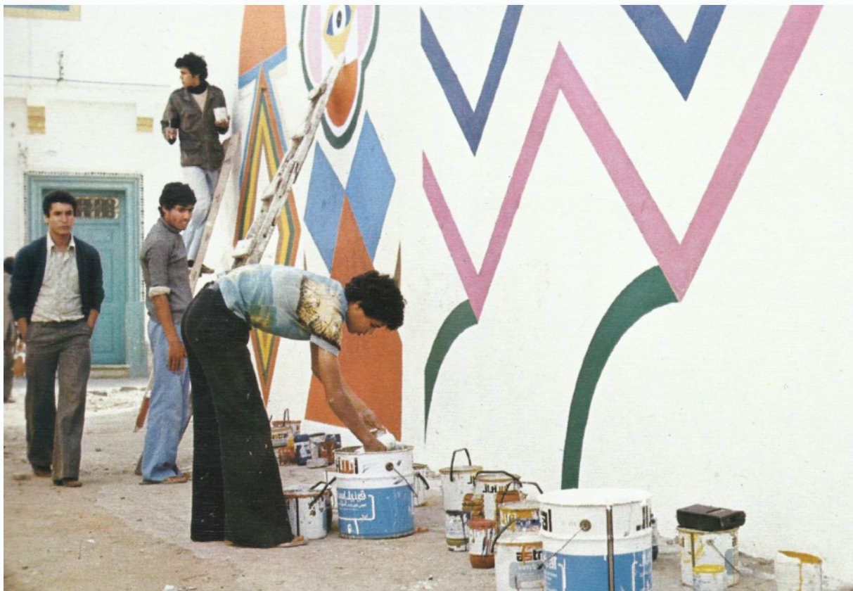
Figure 2: Wall painting by Asilah youngsters. Image reproduced from the catalogue Asilah. First Cultural Moussem July/August 1978 , Shoof Publications, 1979, p. 19.