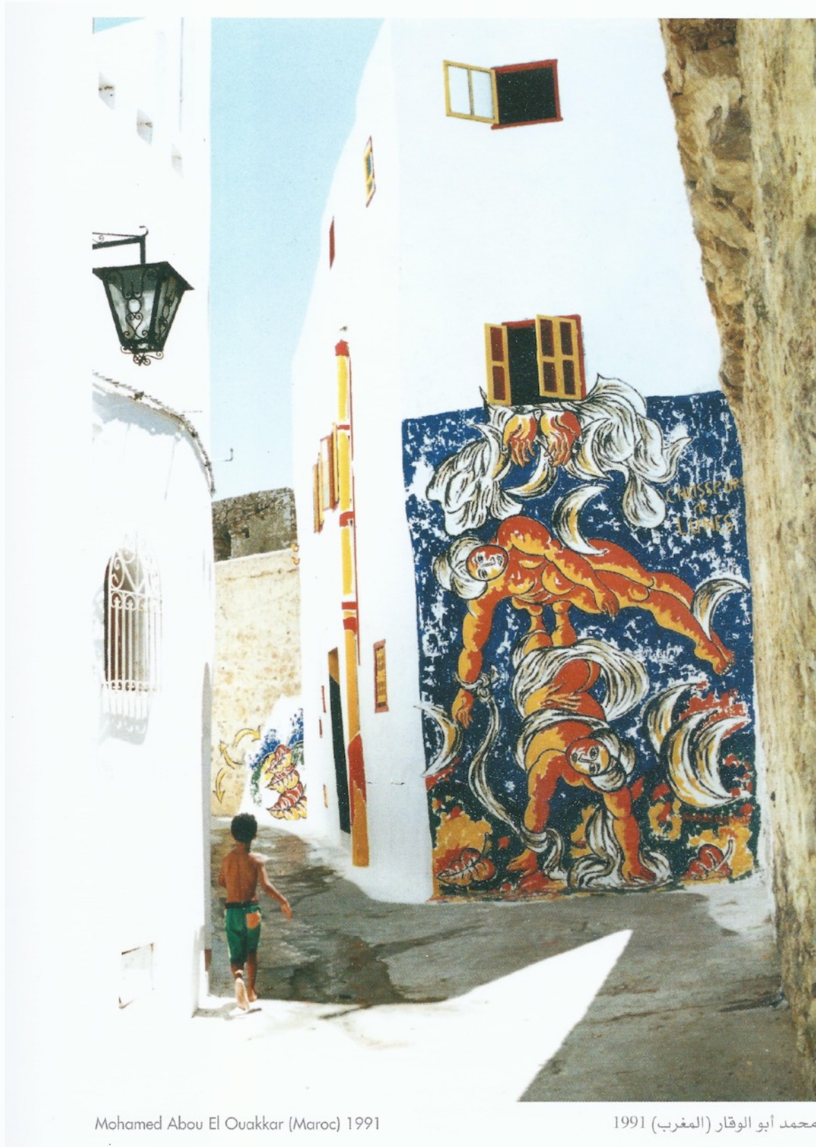
Mohamed Abou El Ouakkar (Maroc) 1991