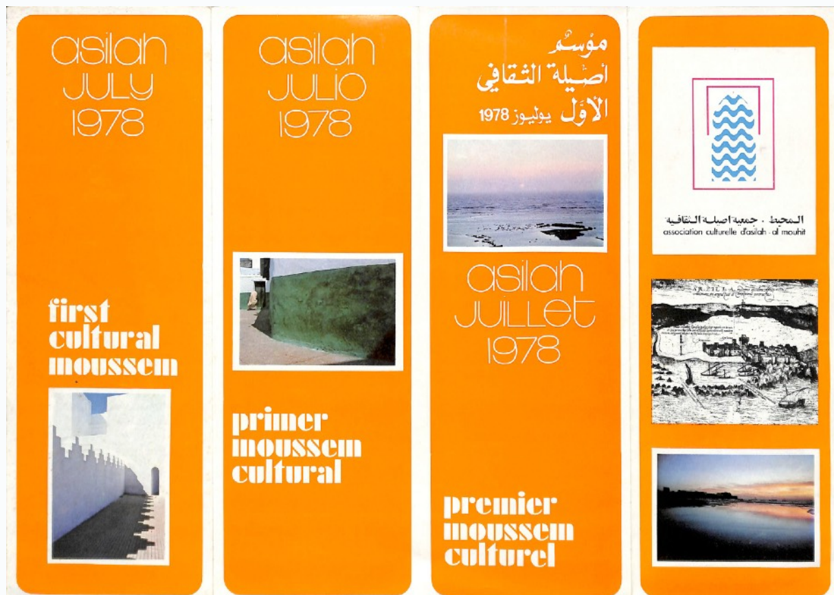
Figure 1: Flyer for the first edition of the Cultural Moussem of Asilah, 1978.

On the Atlantic Coast / In the province of Tangier / Home of ancient civilization: / Phoenician, Roman, Vandal, Arab-Islamic / Asilah: an encounter / People to people. . . thinkers, writers, artists: / To emphasize the role of culture in the evolution of civilization; / To promote man, his traditions, his environment / To lay the foundation for a permanent center of dialogue, encounter, exchange. . . / through collective action, research, contact; / . . . / Through its simplicity of form / Through its density of culture. / Asilah is a symbol of continuity and of authenticity / survivor of touristic rites indifferent to the primary dynamic of guest and host. (Flyer for the first edition of the Cultural Moussem of Asilah)