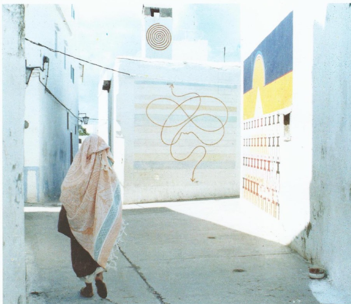
سيدة زيلاشية أمام جدارية فريد بلكاية وجدارية محمد الحميدي (يمين) - أصيلة 1987 Une femme Zailachi devant les peintures de Farid Belkahia et Mohamed Hamidi à droite - Assilah 1987

Figure 4: A woman of Asilah in front of murals by Farid Belkahia and Mohamed Hamidi (right), Asilah 1987.