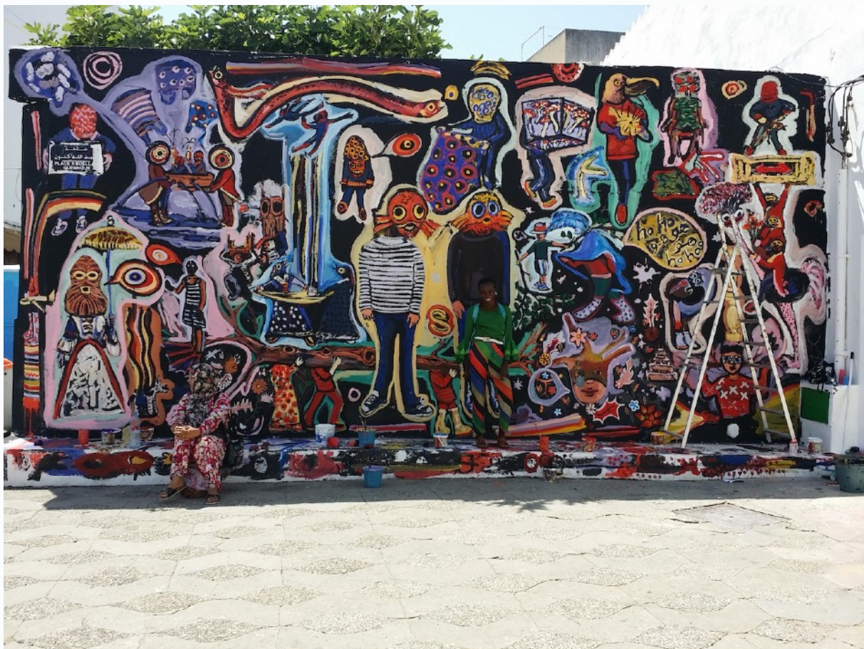
Figure 8: Mural by Yassine Balbzioui, Asilah 2018, courtesy of the artist.