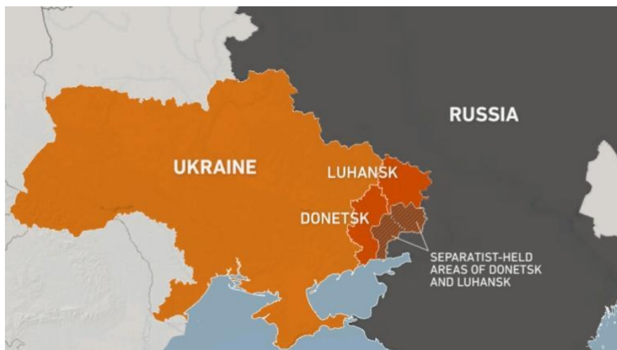
Figure 1: The conflict area in eastern Ukraine