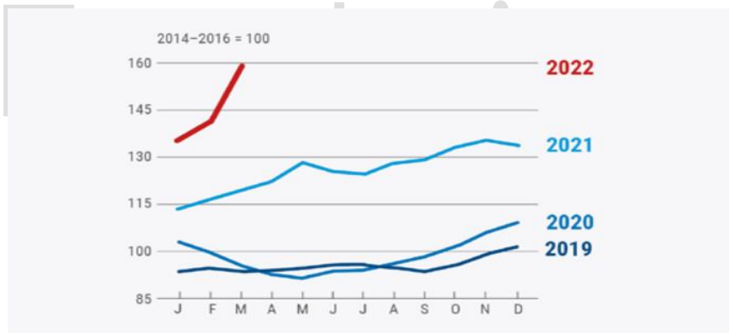
Figure 2: Food index provided by the Food and Agriculture Organization

inflationary trends caused by the war in Ukraine have caused concern for the European Union. Russia's military attack on Ukraine has a direct impact on global food security and the affordability of raw materials. In this regard, the leaders of the European Union stressed at the June 23–24, 2022, European Council meeting that only Russia is to blame for the current global food crisis and urged it to immediately cease targeting agricultural infrastructure and permit the transfer of grain from Ukraine. Based on this, the EU leaders stressed that the Russian invasion of Ukraine has terrible effects for the people there as well as around the world, and that Russia's action has considerably worsened the food security problem (European Council, 2022). The European Union is not the only region where food prices are rising. Ukraine and Russia are the world's top exporters of natural gas and the second-largest exporters of oil, in addition to being the primary suppliers of wheat, barley, corn, and sunflower oil. These two nations export around 5% of the fertilizers used worldwide. Therefore, the price of items will rise as a result of their conflict. The Food and Agriculture Organization (FAO) published its third consecutive record food price index on April 8, 2022.