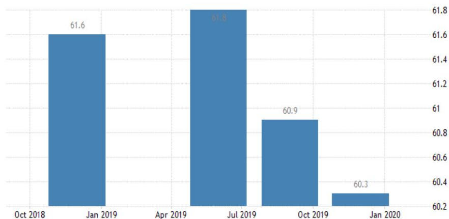
Graph No 1

Angola's business sector has long been affected by the economic crisis of 2008. The dramatic downturn in the national business environment can be traced back as far as 2018 (Gjika, 2020). This important piece of information is supported by another study by the Angolan National Institute of Statistic on employment rate in the same period, as demonstrated below.