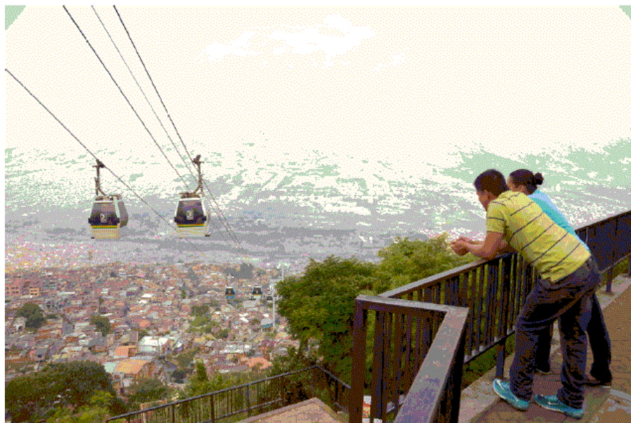
Figure 1 View of Medellín and the Metrocables from España Library-Park