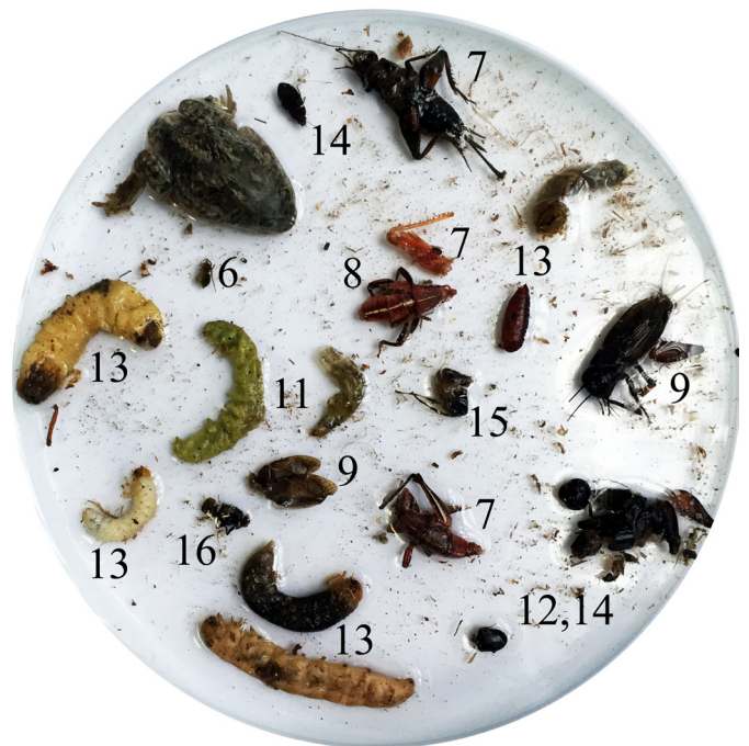
Figure 1. Semi-digested contents of one regurgitated pellet collected at the Cattle Egret colony: 5) Red-Spotted Toad/ Pinto Toad; 6) Spider; 7) (Autumn) Fall Field Cricket; 8) Edible Grasshopper; 9) Two-Spotted Cricket; 11) Night Moth (caterpillar); 13) June Bug (Blind chicken) (larva and pupa); 14) Black Beetle; 15) Domestic Bee; and 16) House Fly. Numbers refer to elements identified in Table 1.

Plant material (Figure 2a), such as grass, roots, leaves, and seeds, comprised just over a quarter of elements in Cattle Egret excreta (Table 2). Remains of animal origin comprised 14% of items observed