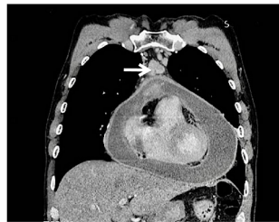
Figure 2 Contrasted chest computed tomography, mediastinal window. There is a 3-millimeter thickening and abnormal pericardial enhancement, pericardial effusion, which does not produce compression of the right ventricle, and pre-aortic adenopathy with heterogeneous enhancement (white arrow).

Taking into consideration the clinical and imaging characteristics, a pericardiocentesis was performed and 275 ml of yellowish liquid were obtained. The cytological analysis was negative for malignancy; the adenosine deaminase (ADA) measurement was 101 IU/l, the polymerase chain reaction for Mycobacterium tuberculosis (IS6110), smear microscopy, and culture (both MGIT and Lowenstein-Jensen) for mycobacteria were all negative.