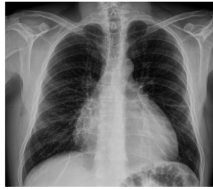
Figure 1 Chest X-ray. PA projection. Global cardiomegaly with rounded cardiac shape. No opacities were observed.