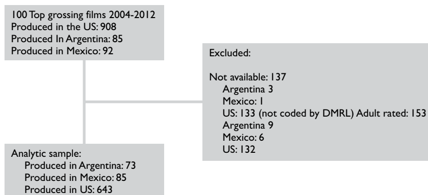
FIGURE I. MOVIES ANALYTIC SAMPLE SELECTION FROM ARGENTINA, MEXICO, AND USA TOP GROSSING FILMS 2004-2012