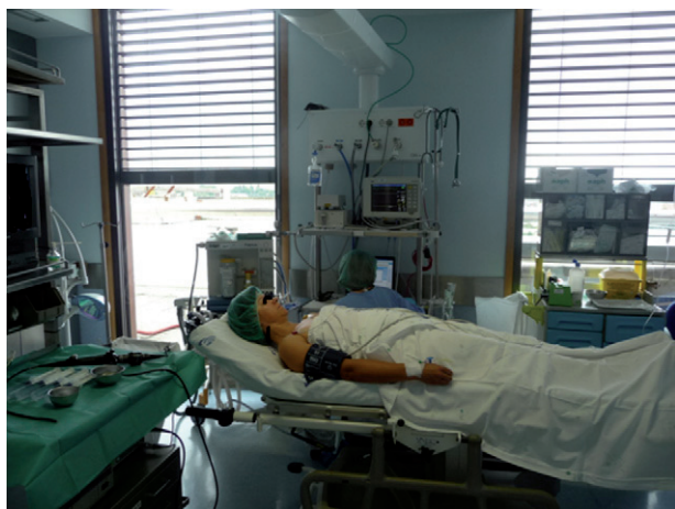
Figure 1 Operating room and monitoring of vital signs.

These techniques can be considered safe since they are widely used and the rate of complications is extremely low. 8-10 A recent retrospective analysis of 23,682 patients undergoing bronchoscopy over a period of 11 years showed a mortality rate of 0.013% with a complication rate of 0.739%. 9 Mortality from medical thoracoscopy ranges between 0.09 and 0.24%. 11 Despite these small numbers, complications do occur and in order to avoid them, the evaluation of the patient before and after any intervention, is of utmost importance. Considering that this issue is of major concern, it is surprising that there are very few up to date studies dealing with these areas, the evidence level remains low and most recommendations (European Respiratory Society, American Thoracic Society and national societies) are based on common sense and the very small number of evidence based publications.