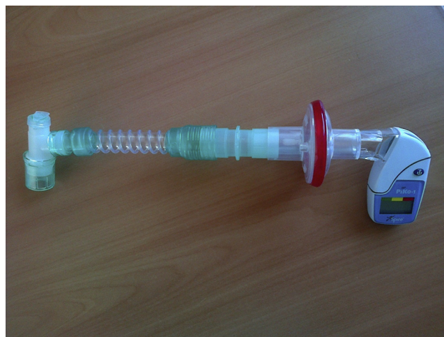
Figure 1 Set-up of an electronic peak flow meter (PiKo I) for measuring cough PEF through the tracheal cannula.

In uncooperative patients (e.g. neurosurgical patients), the patient should be in the supine position with the head of the bed elevated at 30°. Patients with a cuffed tracheostomy tube should have the cuff deflated before measurements are made. Suctioning above the cuff should be done before the cuff is deflated. Oxygen saturation and signs of respiratory distress should be monitored during the measurement process. The cough PEF measurement procedure should be stopped immediately if any of the following occur: respiratory rate greater than 35/min; oxygen saturation, as measured by pulse oximetry, less than 90%; heart rate above 140/min or an increase of more than 20% above resting levels. With sterile conditions, a standardized proportion (12 cm) of a 10F suction catheter should be introduced through the suction port of the swivel elbow connector. The swivel connector with the suction catheter partially inserted is then attached to the patient's tracheostomy tube, which is in turn connected to a viral/bacterial respiratory filter