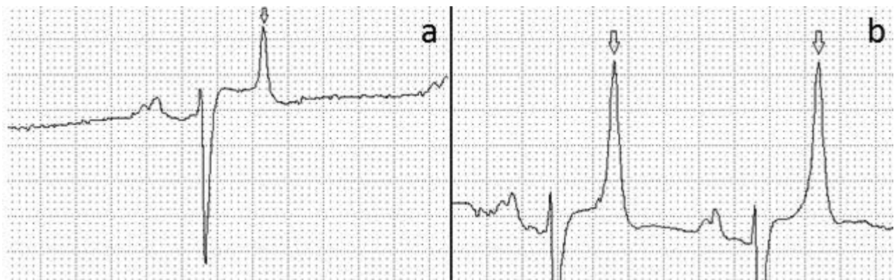
Figure 1. Electrocardiogram in the II bipolar lead, at 25 mm/s of a polo horse presenting a marked increase in the single positive T-wave amplitude highlighted by the arrows. (a) is the result before the pole exercise (M 0 ), and (b), after the exercise (M f ).

exercise without any associated cardiac disease. For Ryan et al (2005), the occurrence of ventricular premature complexes (VPC) and supraventricular premature complexes (SPC) before exercise was relatively common in clinically normal horses. In this study, we observed only one case of VPCs that was repeated three times on the same tracing. The cause of this arrhythmia was not determined, however according to Marr and Bowen (2010) could be associated with hypoxia, ischemia, electrolyte and metabolic disorders, or pre-existing heart disease, such as myocarditis.