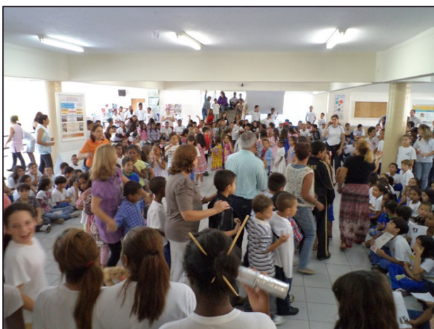
Figure 12 - Festive party at the end of the Charrette 2012