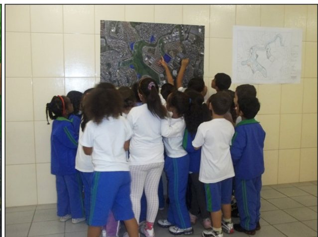
Figures 7 and 8 - Students during the week of the Charrette , 2012