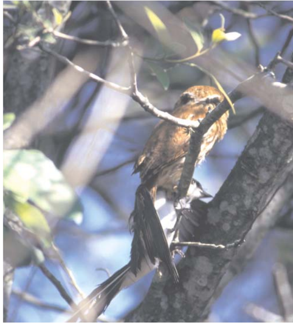
Figure 3. Moments later, the Pygmy-owl captured a mobbing Fork-tailed Flycatcher by pecking its neck; note the eyespots on the nape of this raptor.

Figura 3. Momentos depois, o caburé capturou pelo pescoço uma tesoura que exibiu comportamento de tumulto; note a face occipital na nuca dessa ave de rapina.