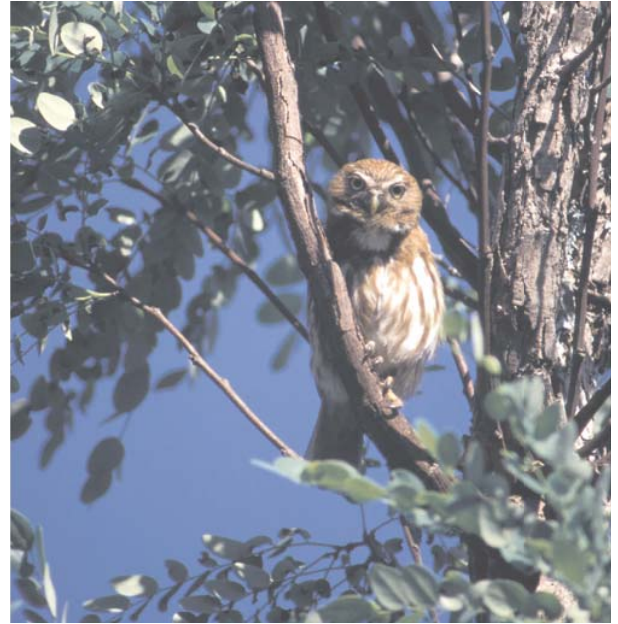
Figure 1. The Ferruginous Pygmy-owl ( Glaucidium brasilianum ) perched on a tree next to the fruiting Ocotea sp., where other birds were feeding on fruits.

Figura 1. O caburé ( Glaucidium brasilianum ) pousado numa árvore próxima da Ocotea sp. em frutificação, onde outras aves estavam consumindo frutos.