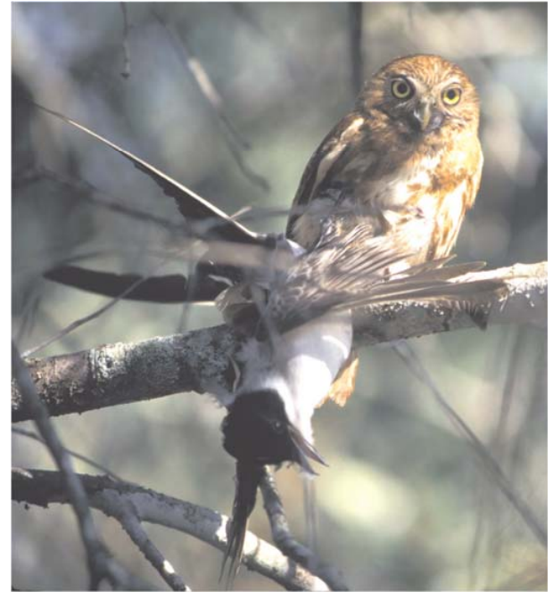
Figure 4. After the fall of both predator and prey to the ground, the owl managed to fly to another branch with its prey almost dead; note the feathers of prey on the bill of the owl.

In all three observations, Ferruginous Pygmy-owls were relatively undisturbed by mobbing and on one occasion even profited from it. As observed by Sick (1993, 1997), this species seems to impassively defy mobbing birds, and in the first reported observation, the individual seemed to approach the fruiting tree searching for potential prey. The eyespots on the nape of the Ferruginous Pygmy-owl are assumed to confuse, scare, and sometimes redirect prey or predator to the real face of the owl (Sick 1993, 1997). Evidence from research on the related Northern Pygmy-owl ( G. gnoma ) supports this last supposition (Deppe et al. 2003).